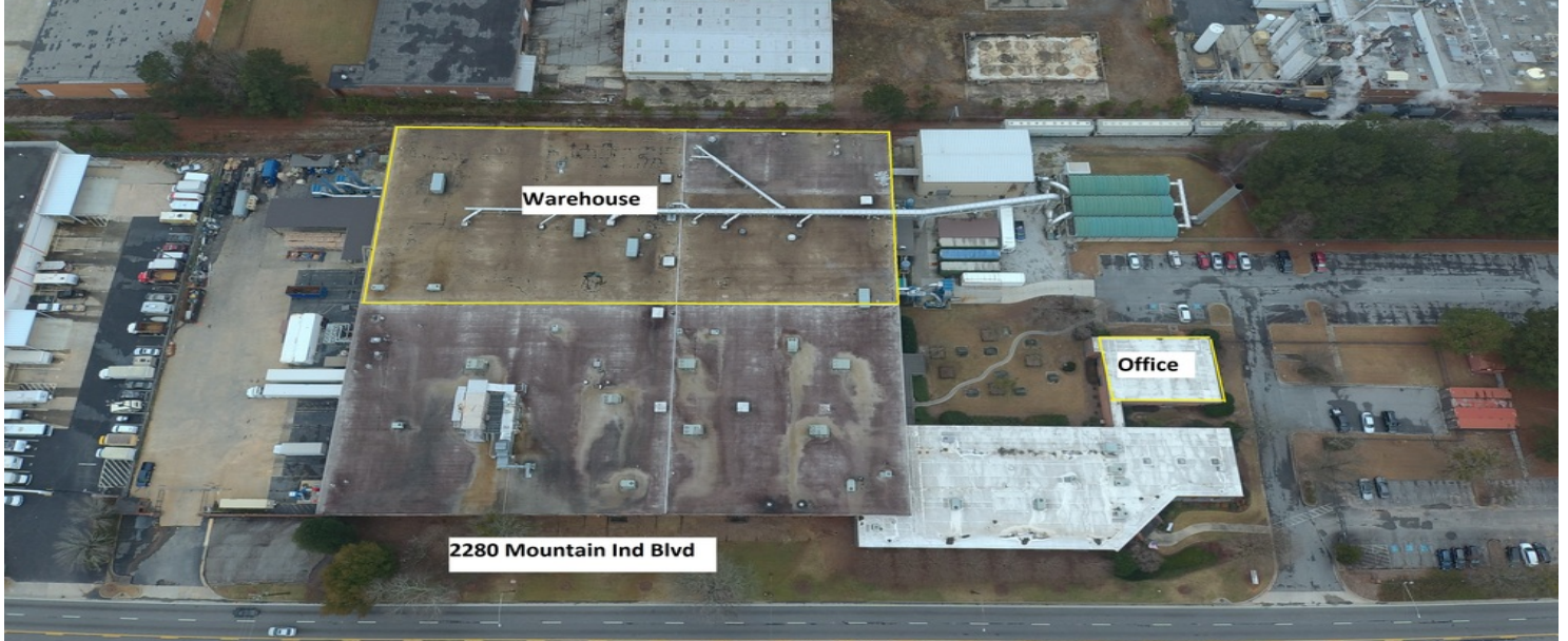
Aerial View of Warehouse & Office Space