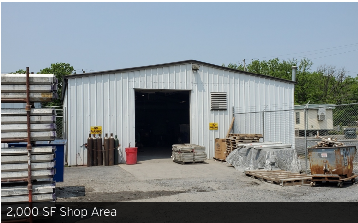
2,000 SF Shop Area