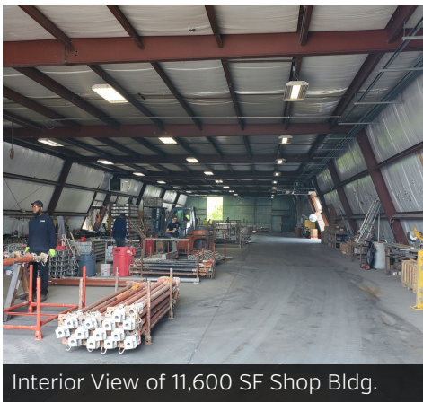
Interior View of 11,600 SF Shop Bldg.