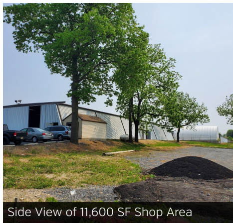
Side View of 11,600 SF Shop Area