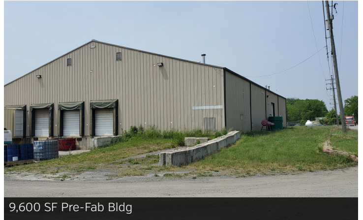
9,600 SF Pre-Fab Bldg