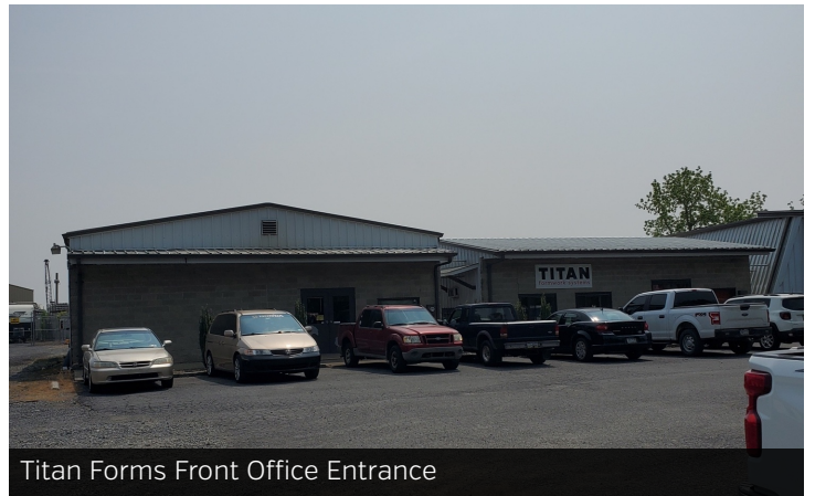
Titan Forms Front Office Entrance