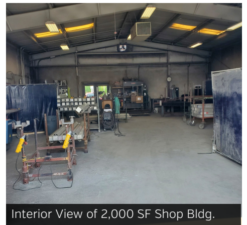
Interior View of 2,000 SF Shop Bldg.

Amy Hawley, SIOR 484.245.1014 amy.hawley@svn.com