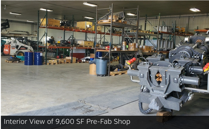
Interior View of 9,600 SF Pre-Fab Shop