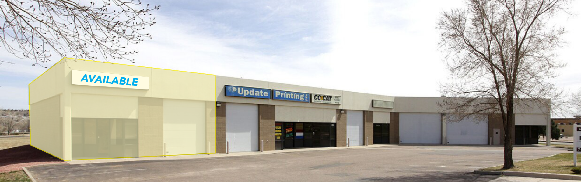
2938 Janitell Rd