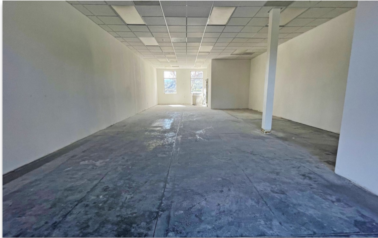
Suite 29125-B - ±1,200 SF

29125 Canwood Street, Agoura Hills, CA 91301