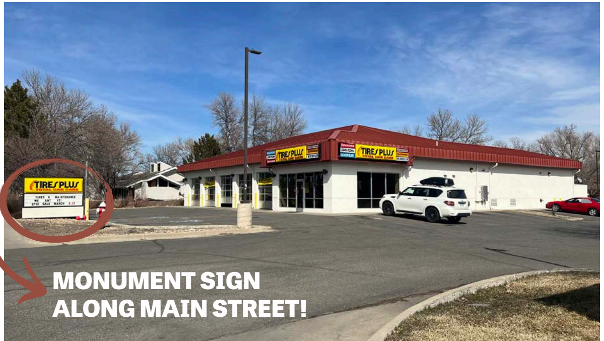
MONUMENT SIGN ALONG MAIN STREET!