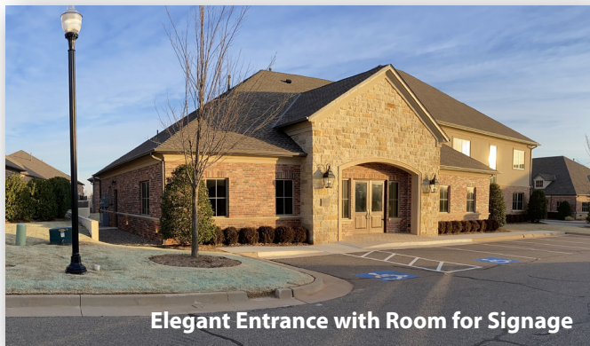
Elegant Entrance with Room for Signage