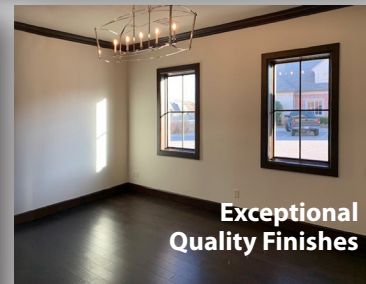
Exceptional Quality Finishes