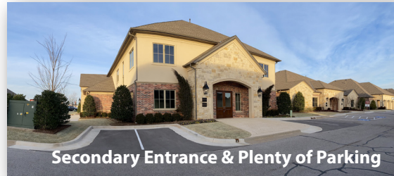
Secondary Entrance & Plenty of Parking