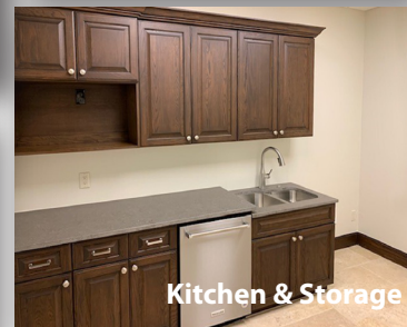
Kitchen & Storage