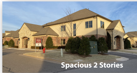
Spacious 2 Stories