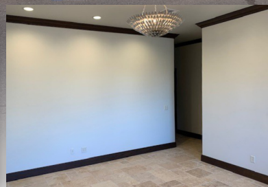
Variety of office sizes available