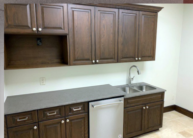
Open kitchen with great storage

Contact: Rod Baker, CCIM • bakerr@bakerfirst.com • Office: 405.947.7200 • Cell: 405.818.2800