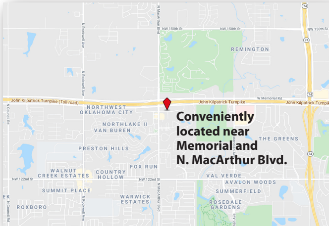
Conveniently located near Memorial and N. MacArthur Blvd.