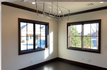
Great views & contemporary light fixtures