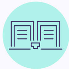
Ability to combine units