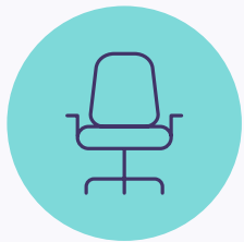
Fitted first floor offices to selected units