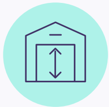
6.5m clear internal height