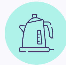
Kitchenette to selected units