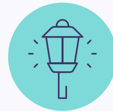
External yard lighting