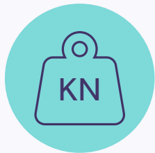
37.5kN sq m floor loading