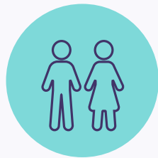
Toilets to selected units