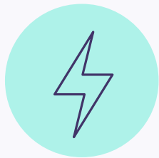
Three phase electrical supply