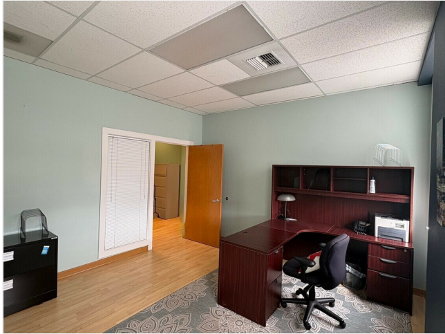
Inside Office 1