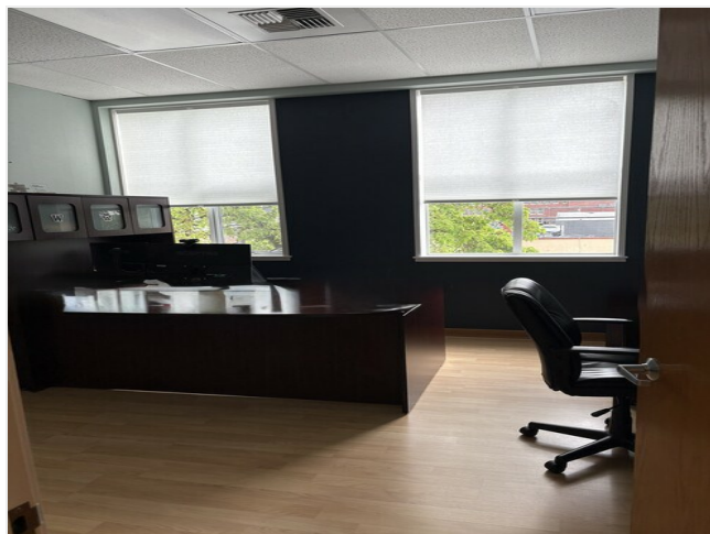
Private Office 2