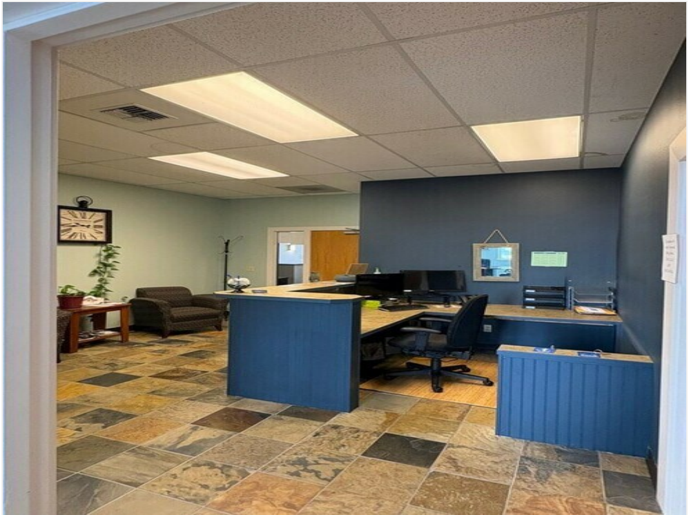
Shared Reception Area