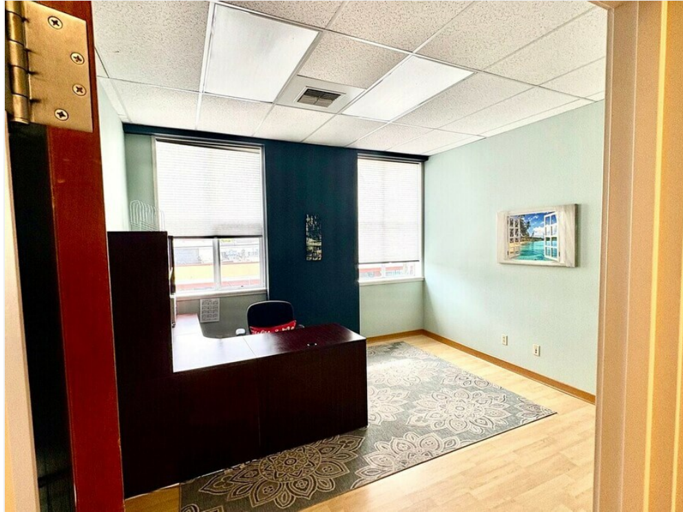
Private Office 1