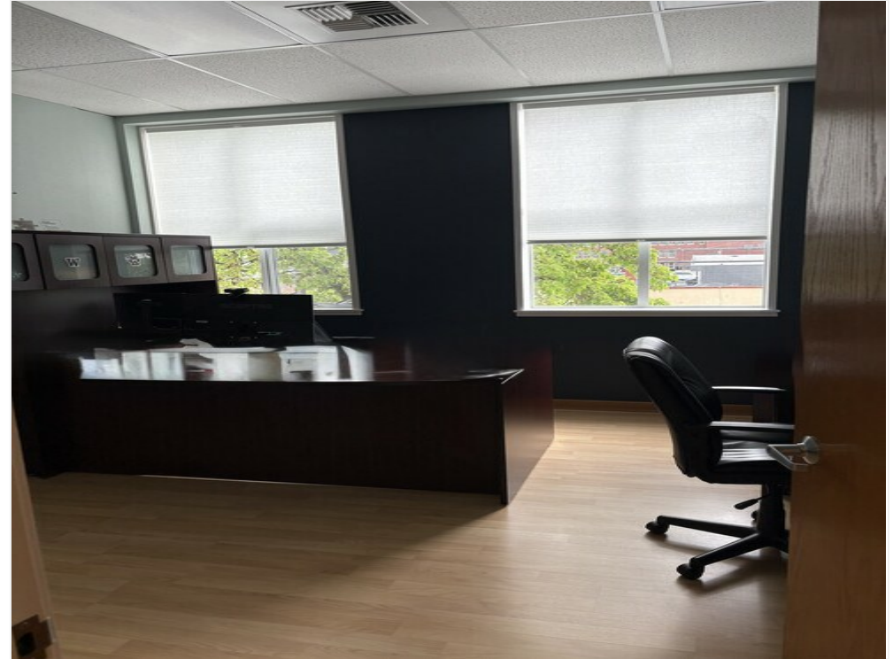
Private Office 2