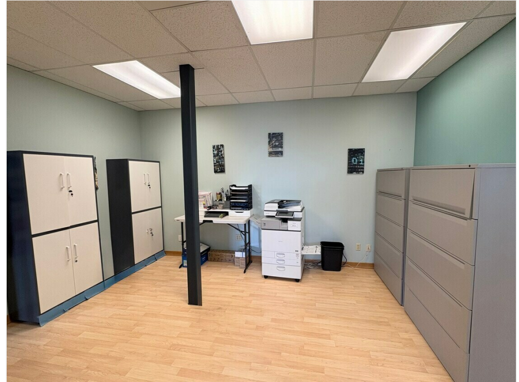
Shared Work Area