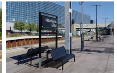
Milton Keynes Central - 3 miles

DISCLAIMER: The Agents for themselves and for the vendors or lessors of the property whose agents they are give notice that, (i) these particulars are given without responsibility of The Agents or the Vendors or Lessors as a general outline only, for the guidance of prospective purchasers or tenants, and do not constitute the whole or any part of an offer or contract; (ii) The Agents cannot guarantee the accuracy of any description, dimension, references to condition, necessary permissions for use and occupation and other details contained herein and any prospective purchasers or tenants should not rely on them as statements or representations of fact but must satisfy themselves by inspection or otherwise as to the accuracy of each of them; (iii) no employee of The Agents has any authority to make or give any representation or enter into any contract whatsoever in relation to the property; (iv) VAT may be payable on the purchase price and / or rent, all figures are exclusive of VAT, intending purchasers or lessees must satisfy themselves as to the applicable VAT position, if necessary by taking appropriate professional advice; (v) The Agents will not be liable, in negligence or otherwise, for any loss arising from the use of these particulars. 10.16.