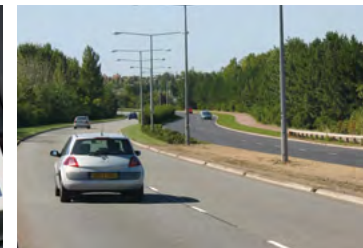
Direct and easy access to M1 and A5