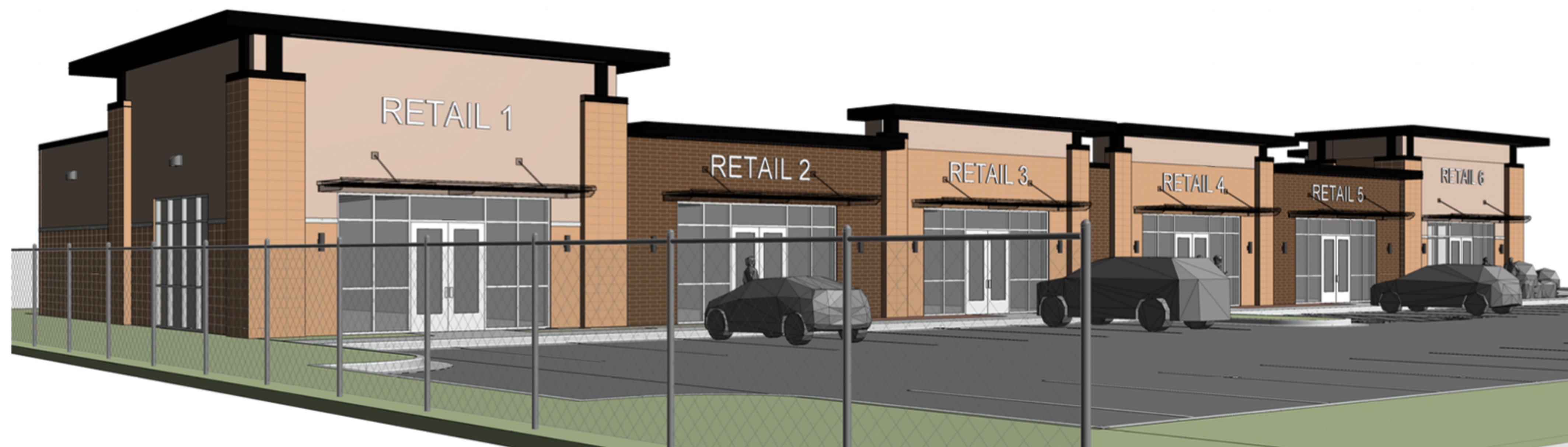
2 Isometric View Left Side SCALE