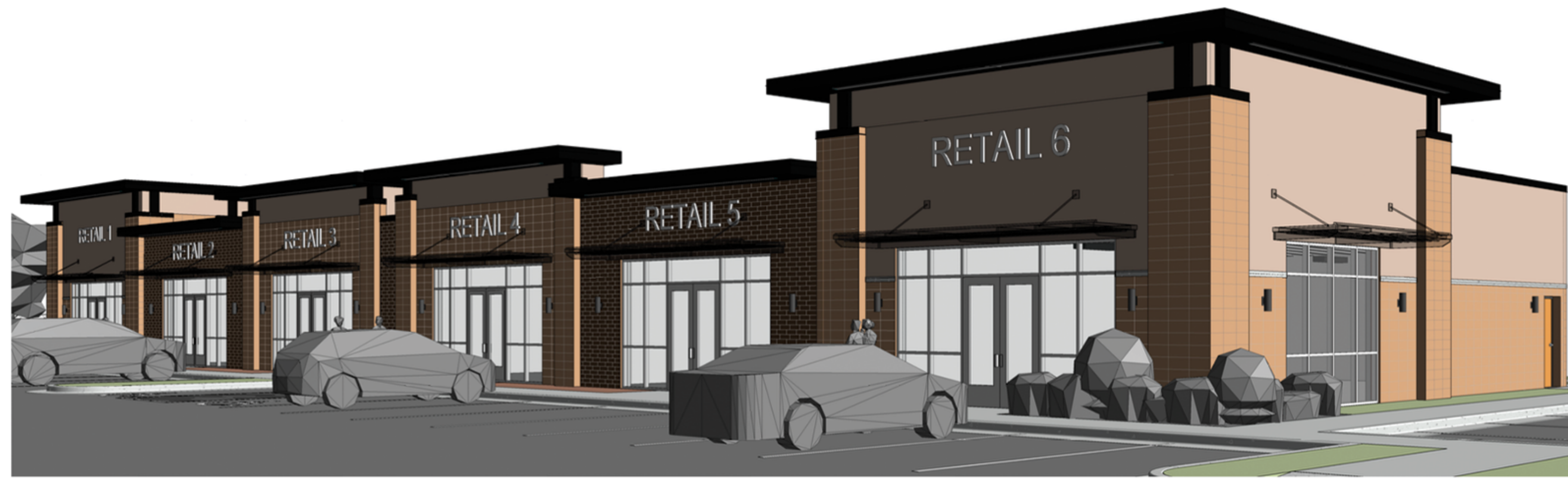
3 Isometric View Right Side SCALE