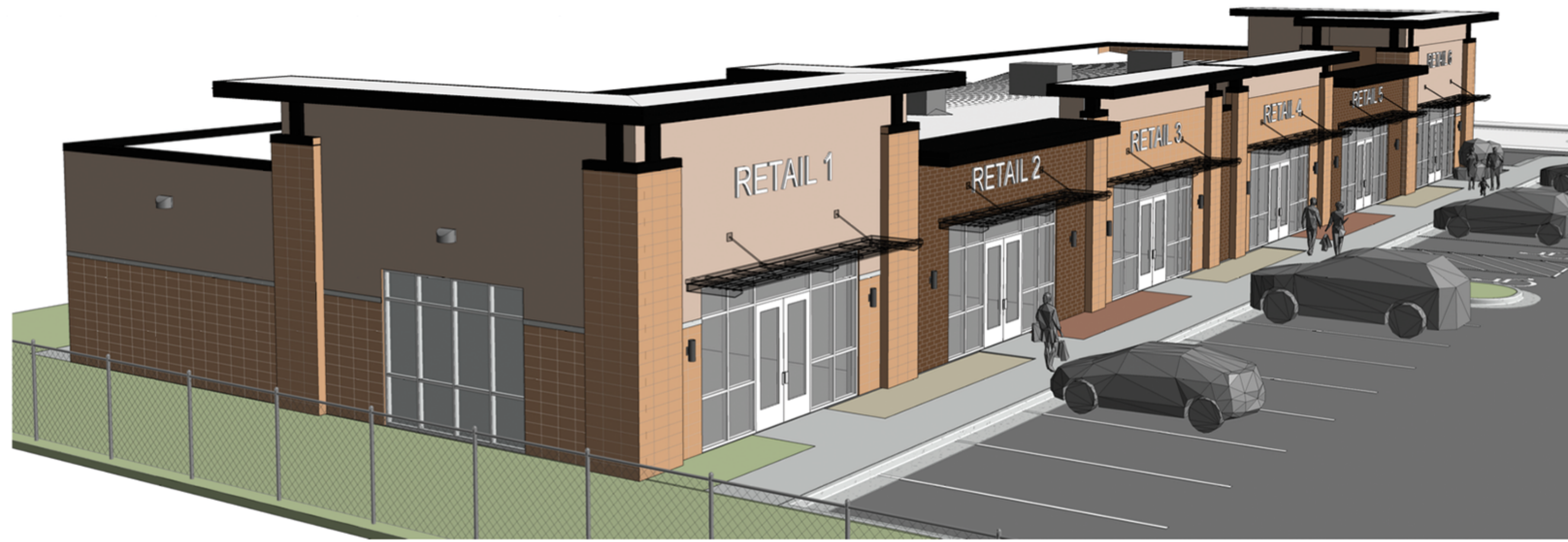
1 Isometric View Birdseye SCALE