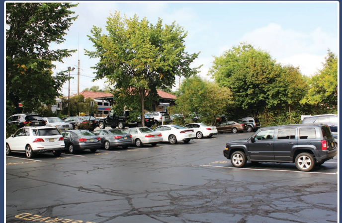
Building parking lot in forefront, Chatham Station in background.