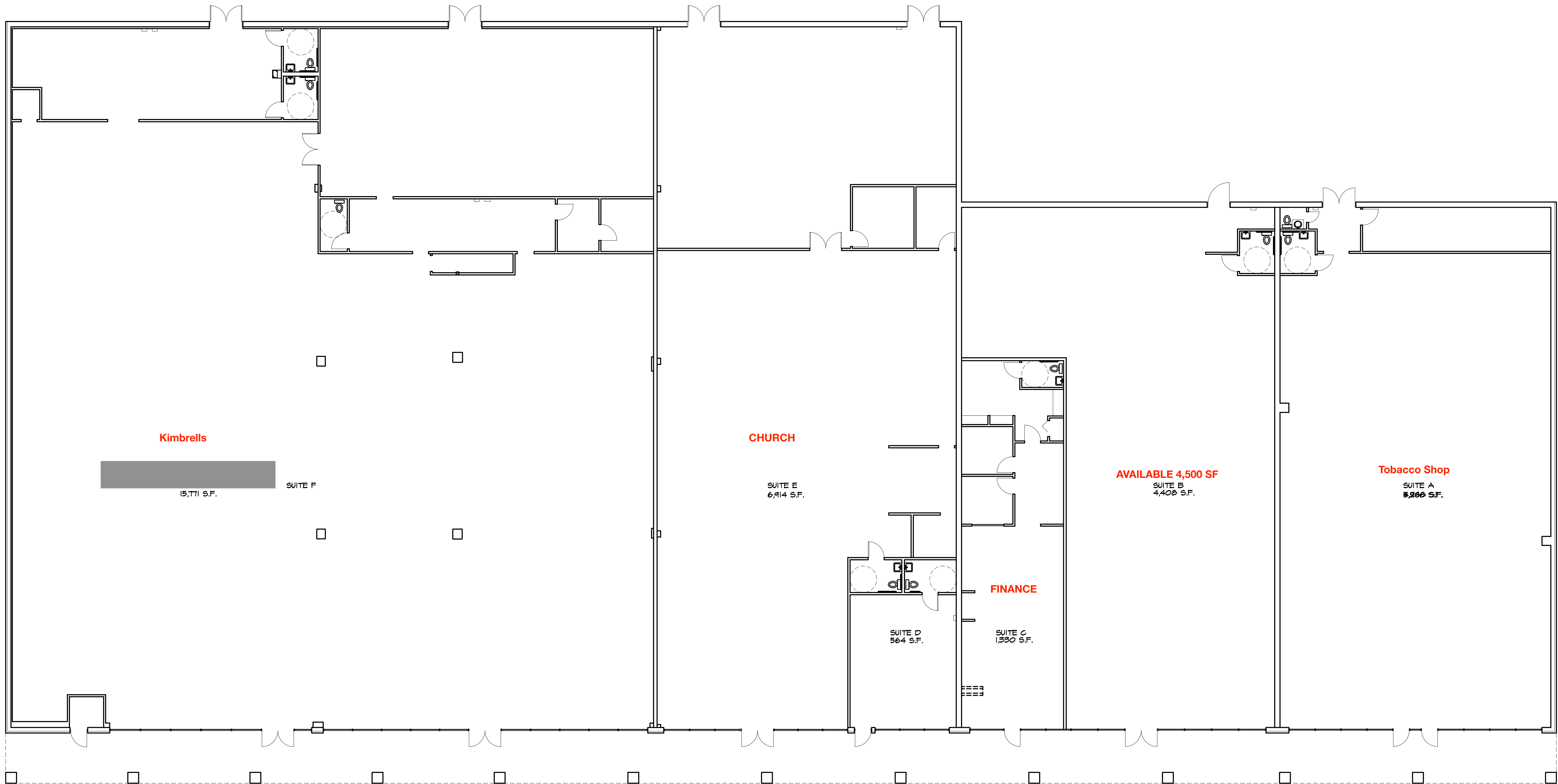
FLOOR PLAN B SCALE: 1" = 10'

PRELIMINARY FOR REVIEW. NOT FOR CONSTRUCTION. DATE UPDATED FEBRUARY 12, 2016 COPYRIGHT (C) 2012, HENRY DARRELL CARPENTER, AIA