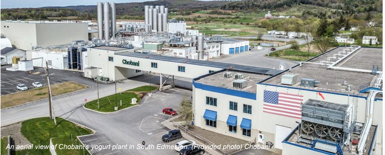
An aerial view of Chobani's yogurt plant in South Edmeston.

Chobani to invest $1.2 billion into building a 1.4 million square-foot dairy processing plant at Griffiss Business and Technology Park — the largest investment in natural food manufacturing in the United States. The Triangle Site, measuring around 332 acres at Griffiss International Airport, will house the new Greek yogurt manufacturing facility. Chobani aims to create more than 1,000 jobs in Oneida County, nearly doubling Chobani's New York State workforce.