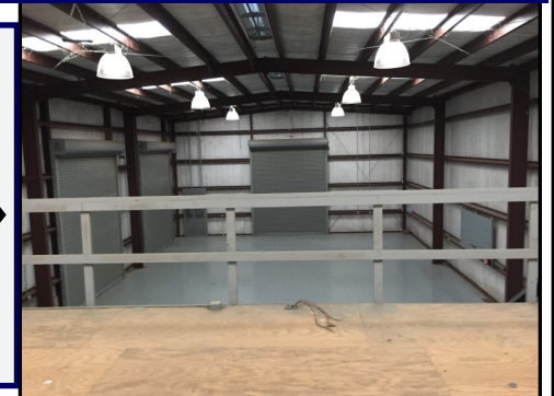
2,400 SF OPEN WAREHOUSE SPACE