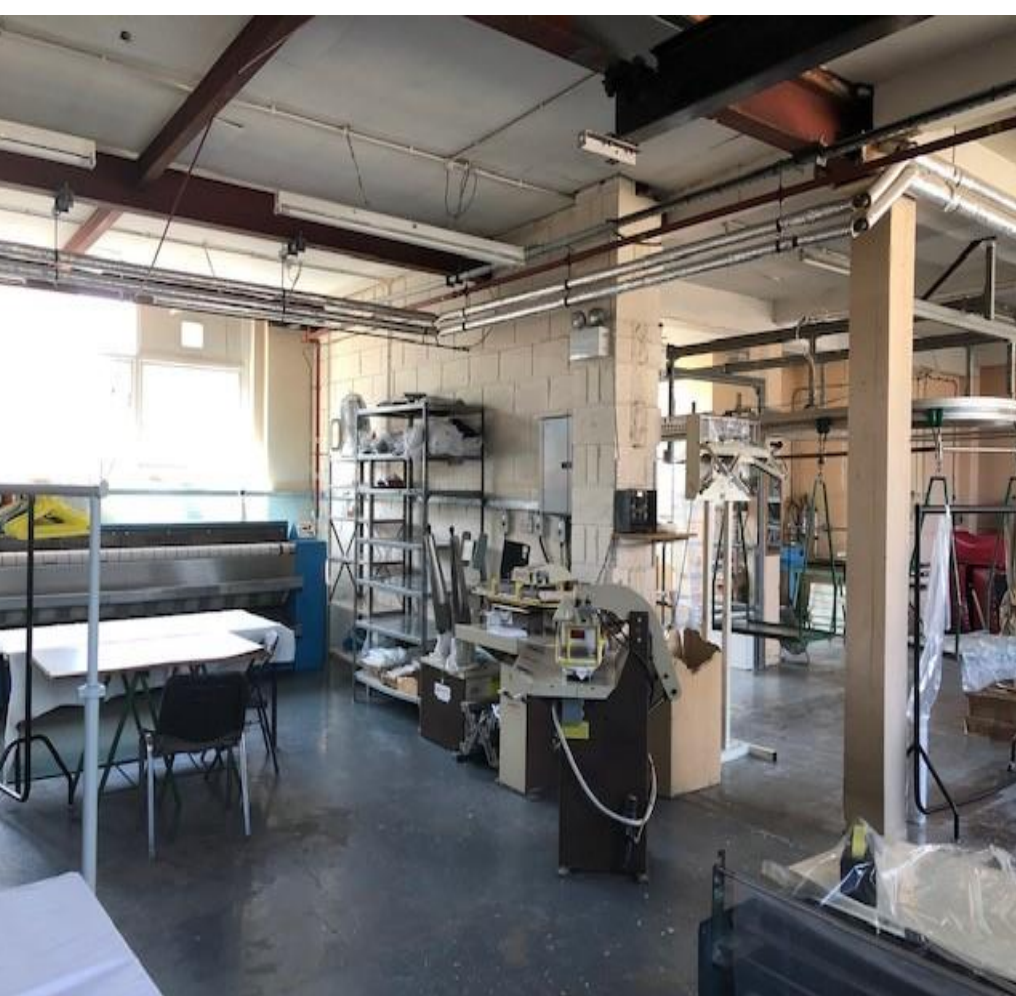
KITCHEN / PRODUCTION AREA