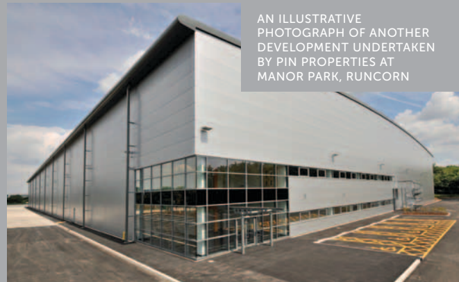
AN ILLUSTRATIVE PHOTOGRAPH OF ANOTHER DEVELOPMENT UNDERTAKEN BY PIN PROPERTIES AT MANOR PARK, RUNCORN