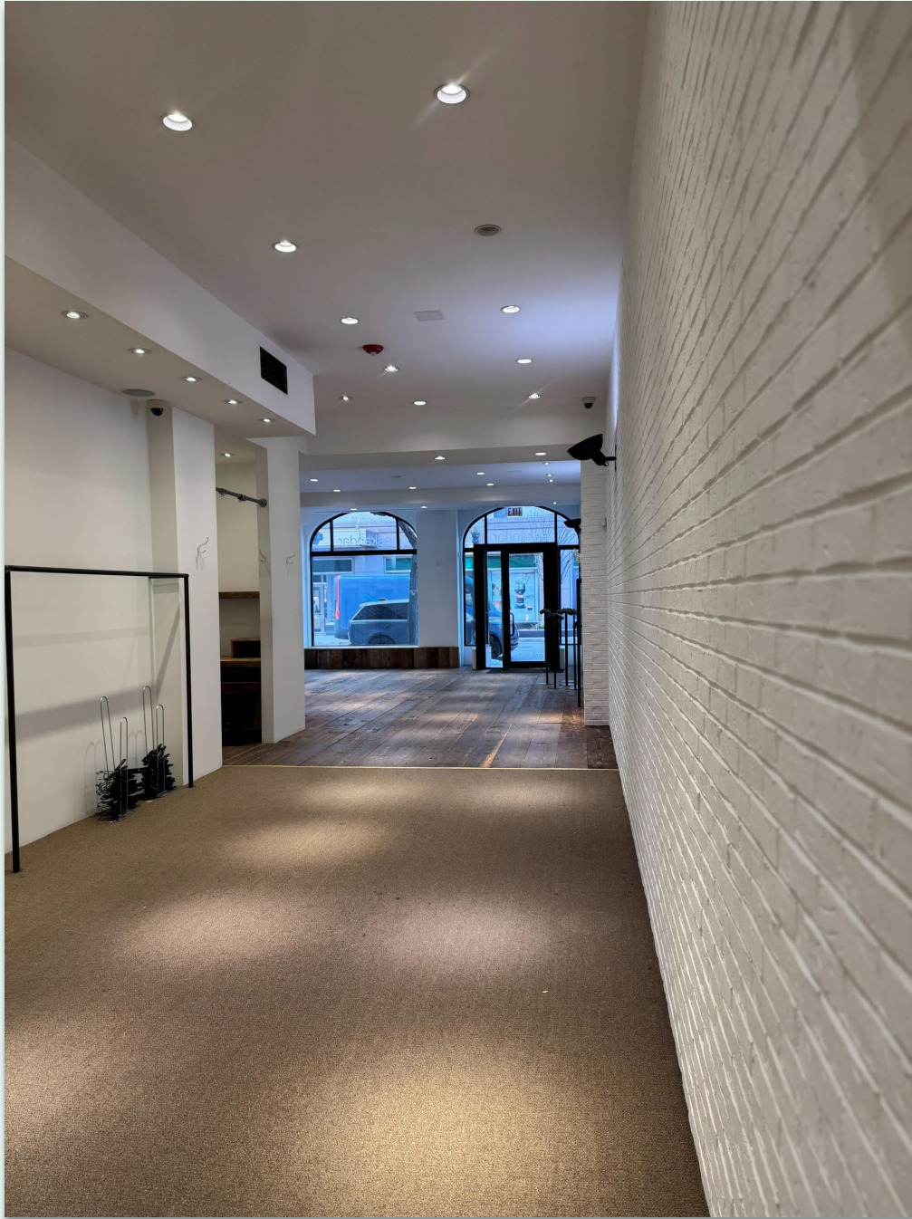
Views from the Back