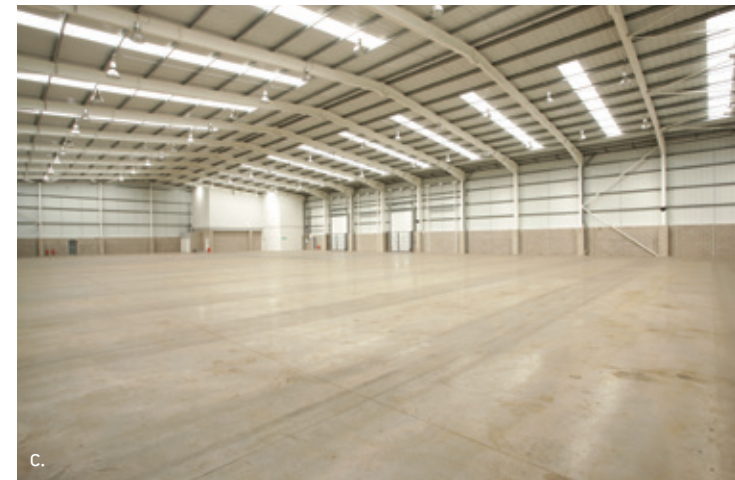
a,b,c - for illustrative purposes only