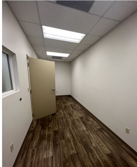
Two rooms for offices or alternate use with a large handicap accessible bathroom.