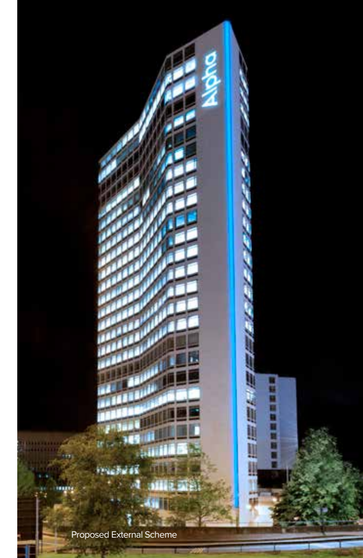
Proposed External Scheme

The landmark status of the building will also be reinforced through a striking external lighting scheme, maximising its impact on the city's skyline.