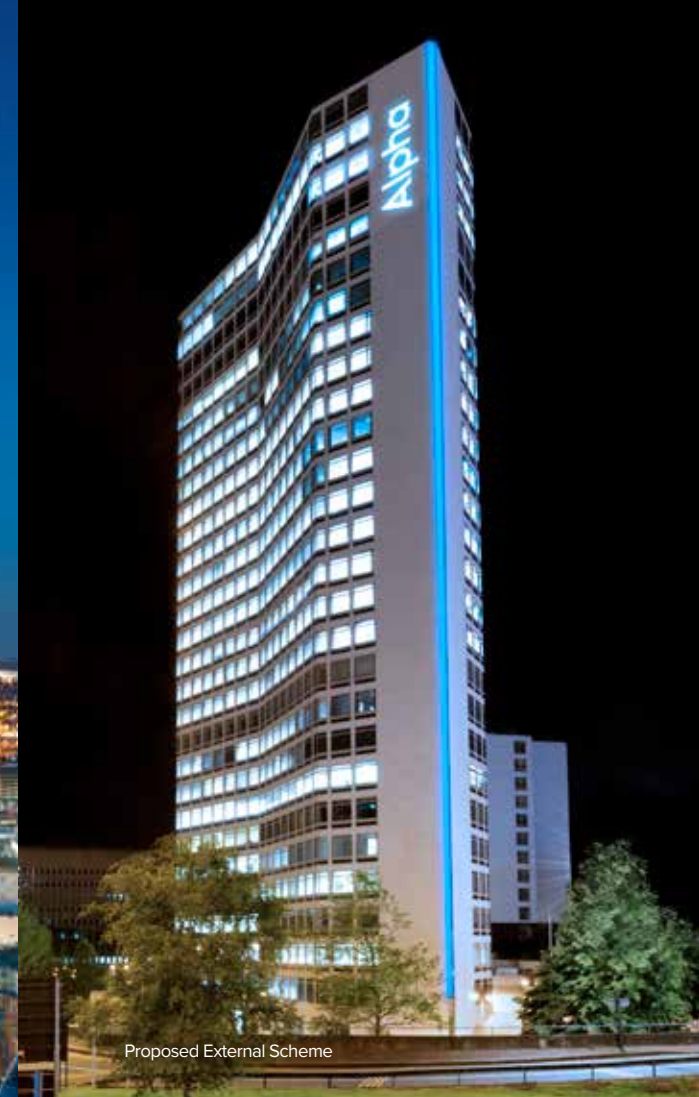
Proposed External Scheme