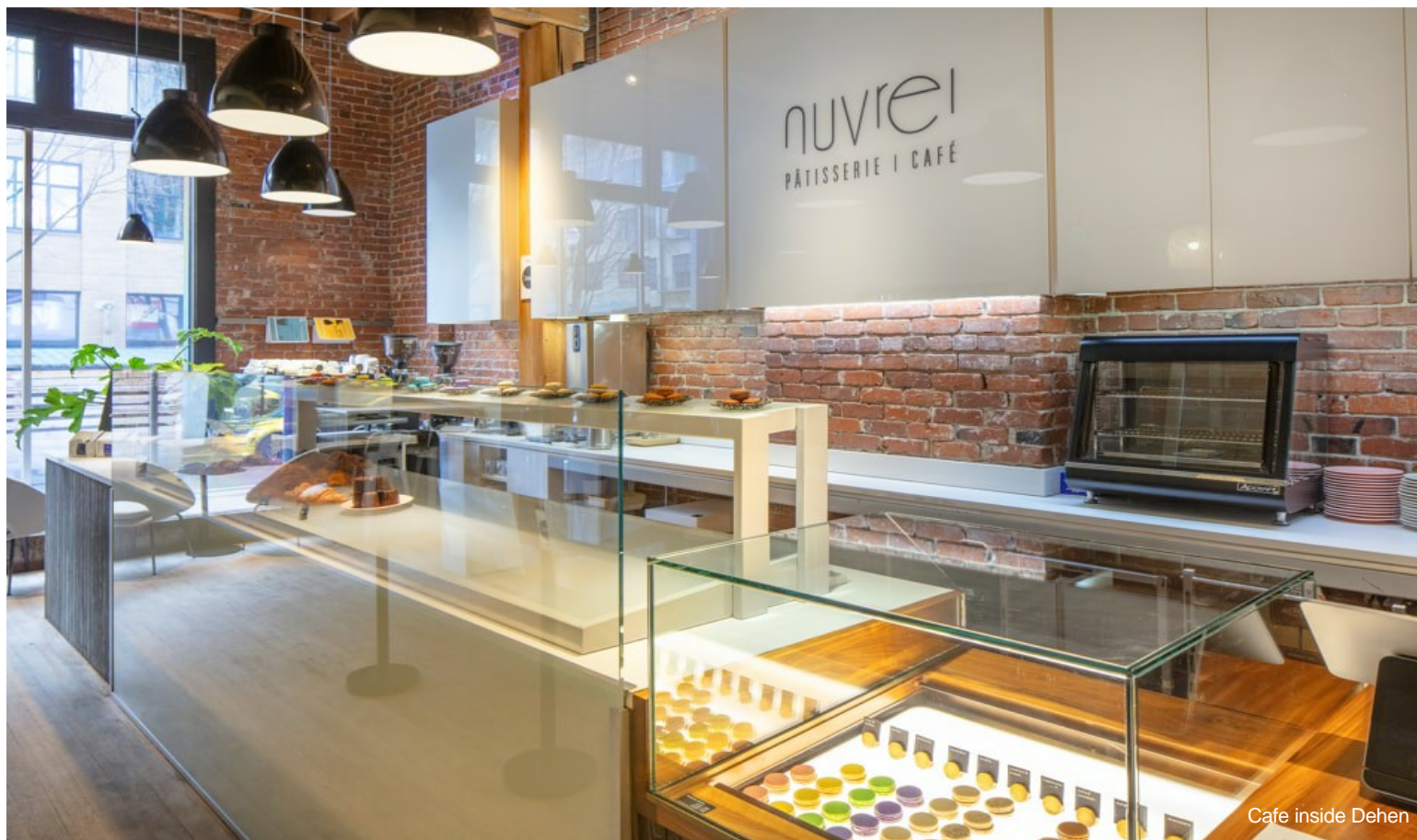
Cafe inside Dehen