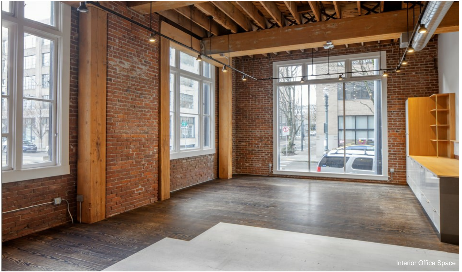
Interior Office Space