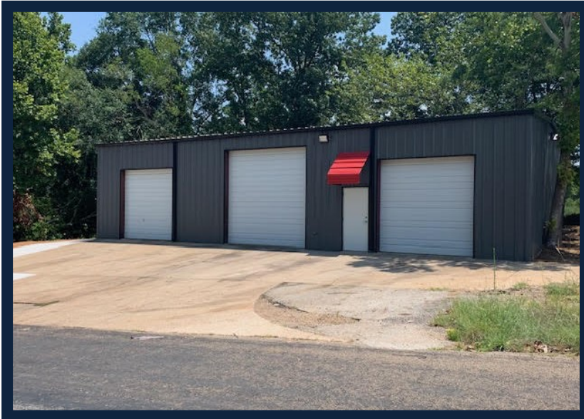
Front of Building with Concrete and Parking