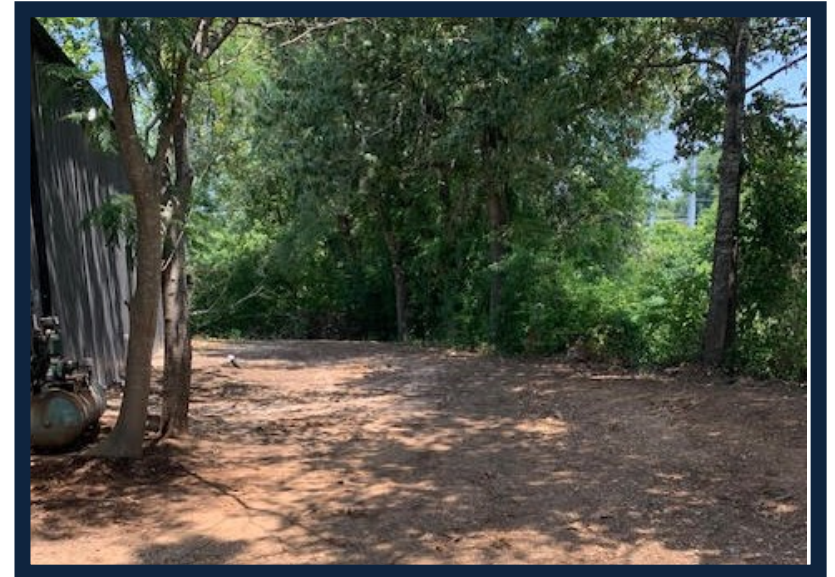
Rear Outside Storage Area