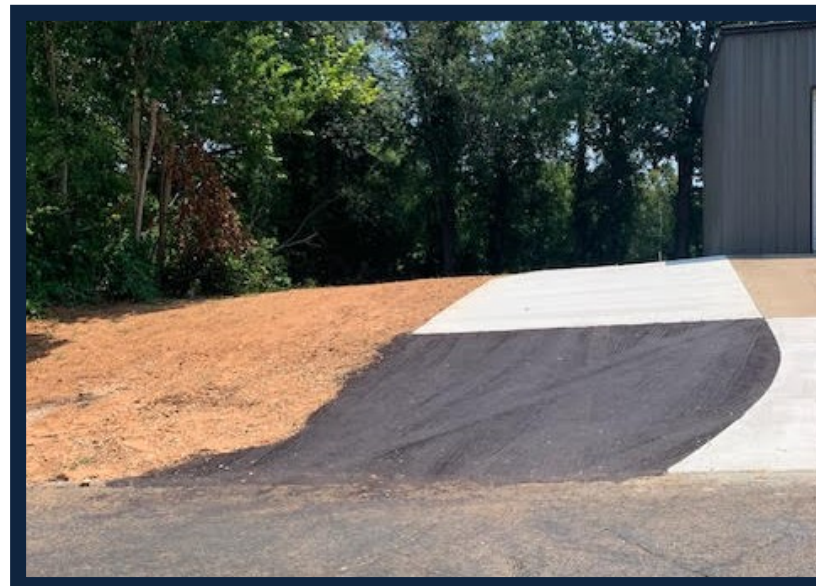
Concrete Pad for Outside Storage Area on North End of Building