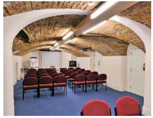
Meeting Room at QUEENS COURT