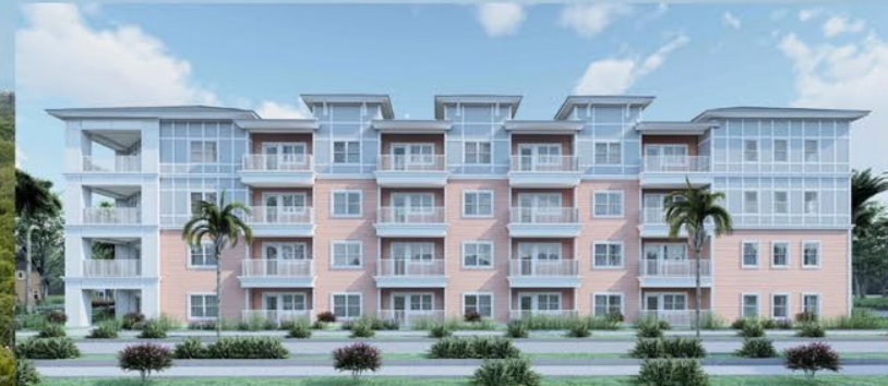
74-Unit 'Park Vista' Apartments