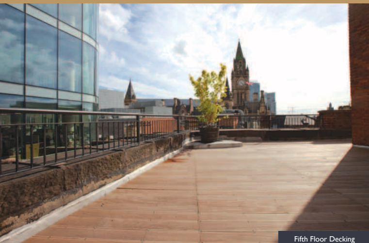
Fifth Floor Decking

The accommodation will be made available by way of a new Full Repairing and Insuring lease for a period of years to be agreed.