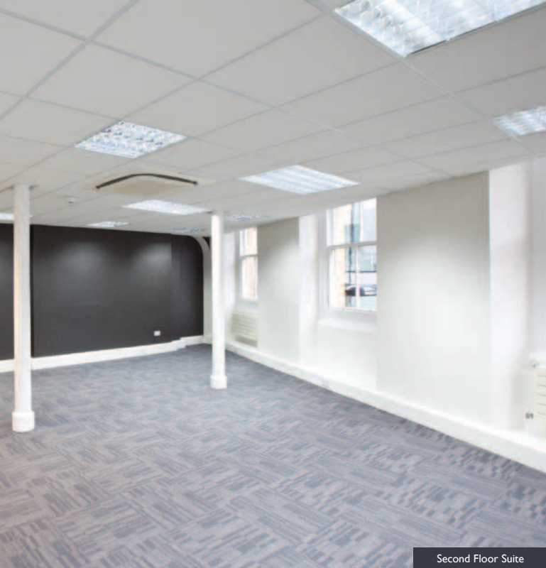
Second Floor Suite