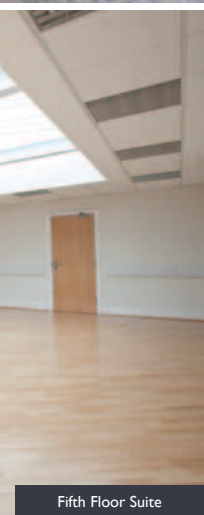
Fifth Floor Suite