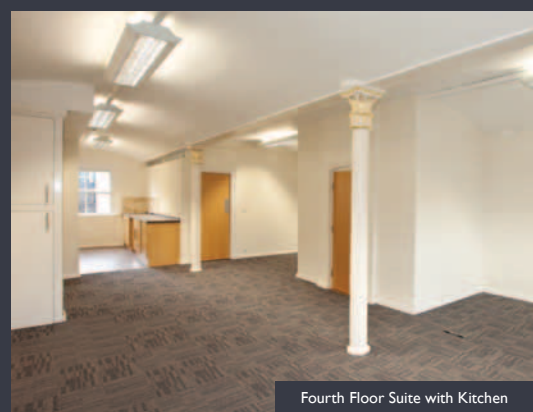
Fourth Floor Suite with Kitchen