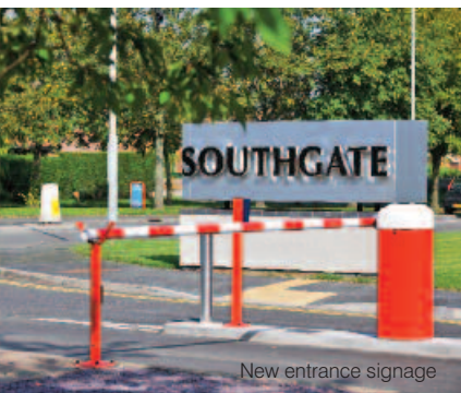
New entrance signage

Southgate provides the ideal business destination by combining high quality office space with superb amenities in one first class location. Nearby Handforth Dean Retail Park and Stanley Green Retail Park offer a broad and diverse mix of retailers including Tesco, Marks & Spencer and Next amongst others and there are an excellent range of leisure facilities. Handforth and Heald Green village centres are within walking distance and offer a whole range of local and everyday amenities. Wilmslow town centre which boasts a mix of quality restaurants and shops is approximately 5 minutes drive away and Manchester city centre just 25 minutes.