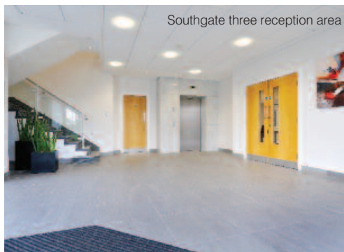
Southgate three reception area