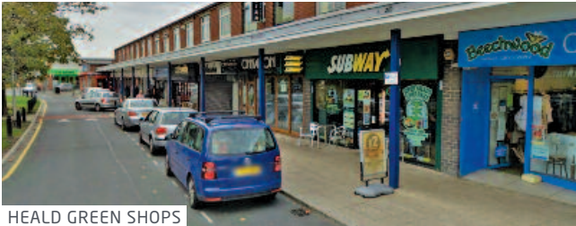
HEALD GREEN SHOPS