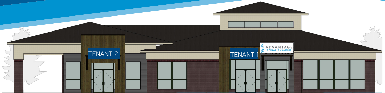
Proposed Expansion & Façade Improvement Renderings