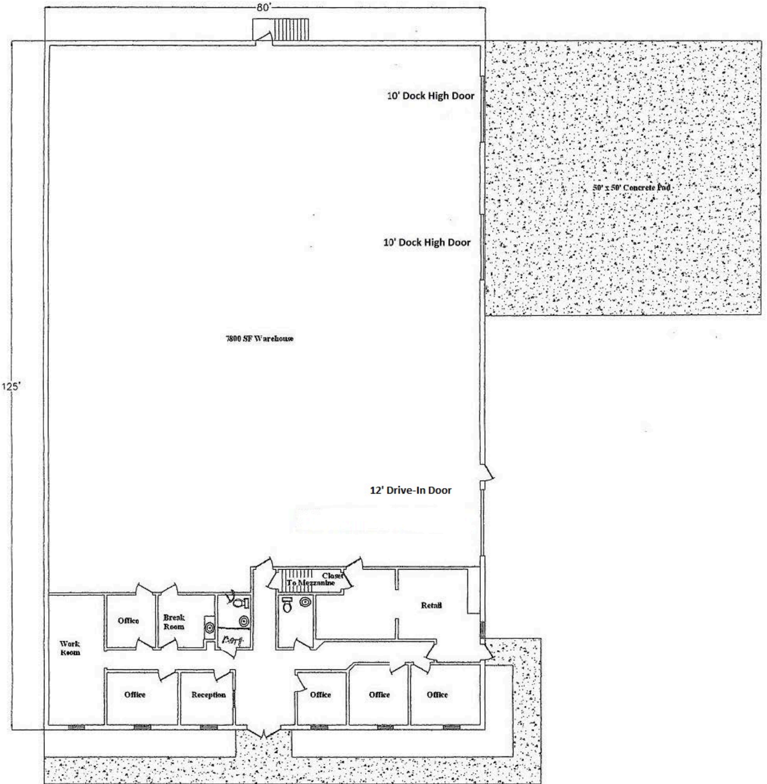
1018 Dillard Drive Building Layout