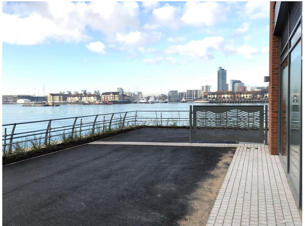
External terrace and view