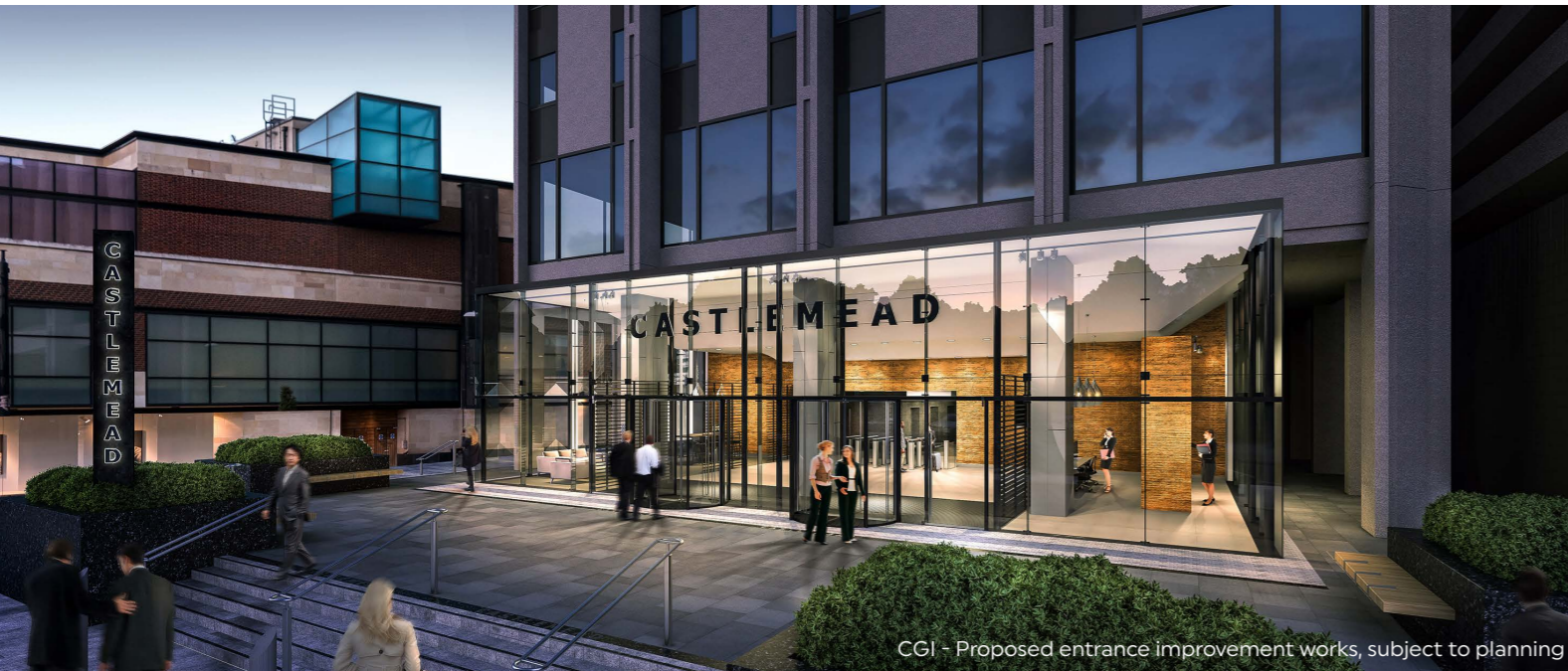
CGI - Proposed entrance improvement works, subject to planning