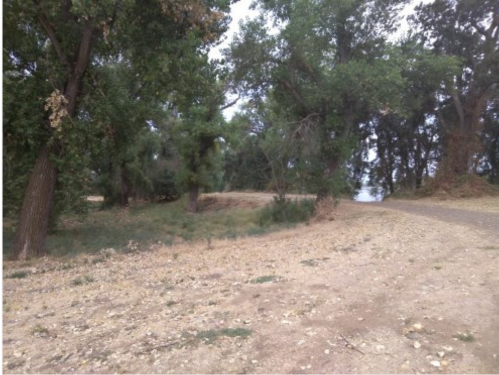
Road to the River