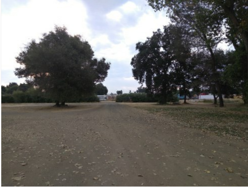
Main Driveway from House