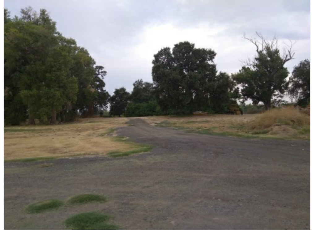
Road to the River