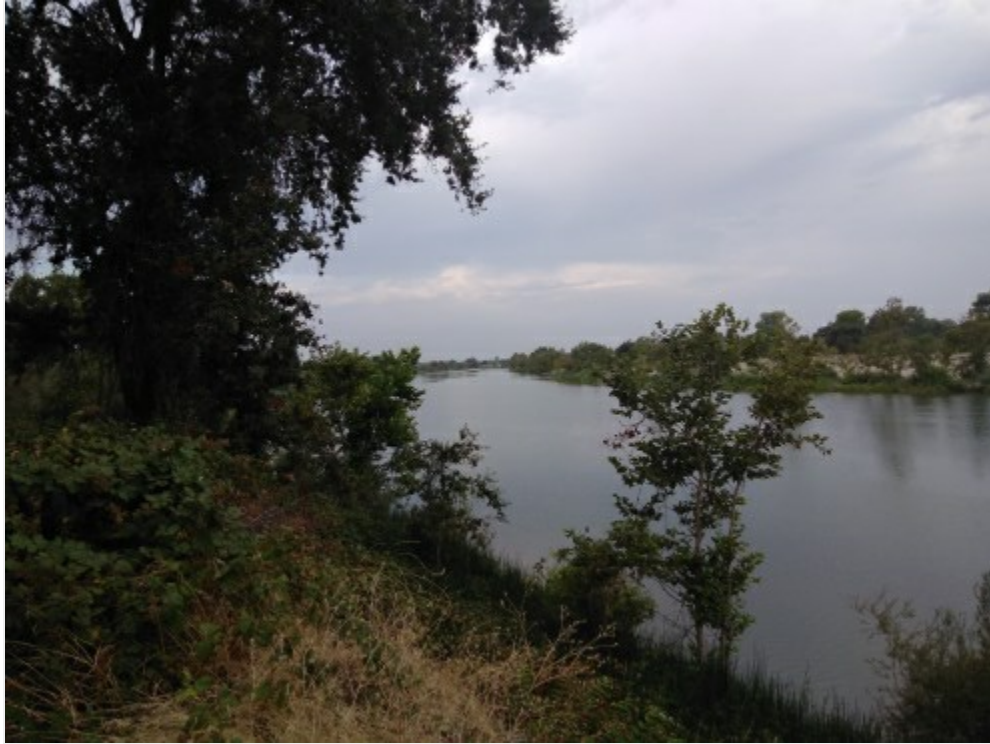
River View due South