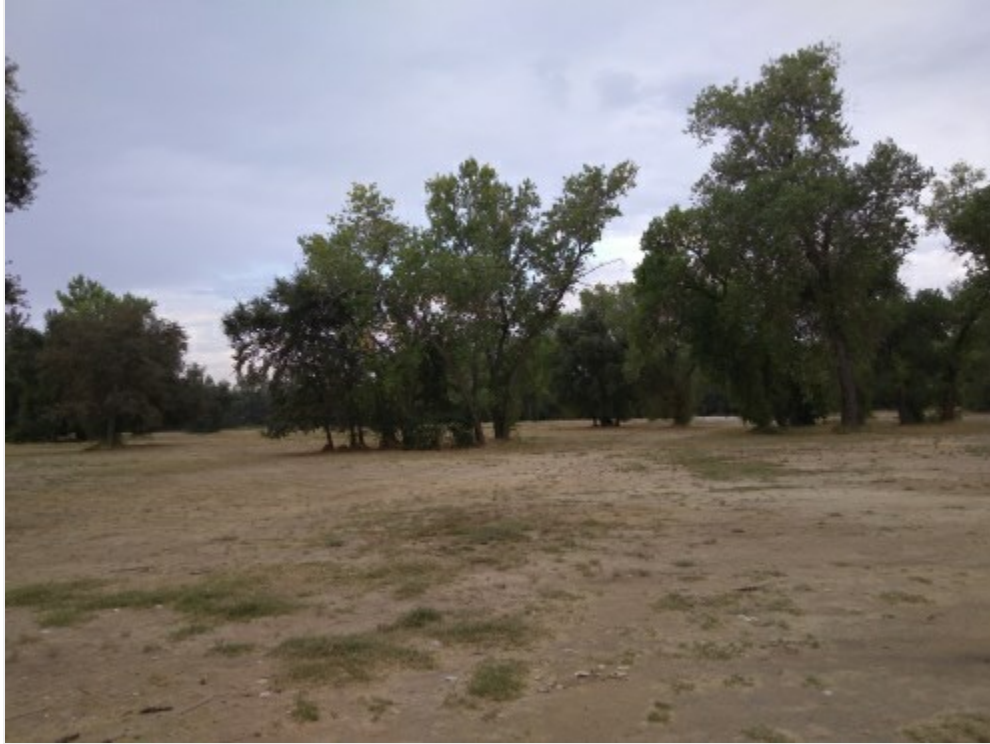
Old Growth Live Oaks