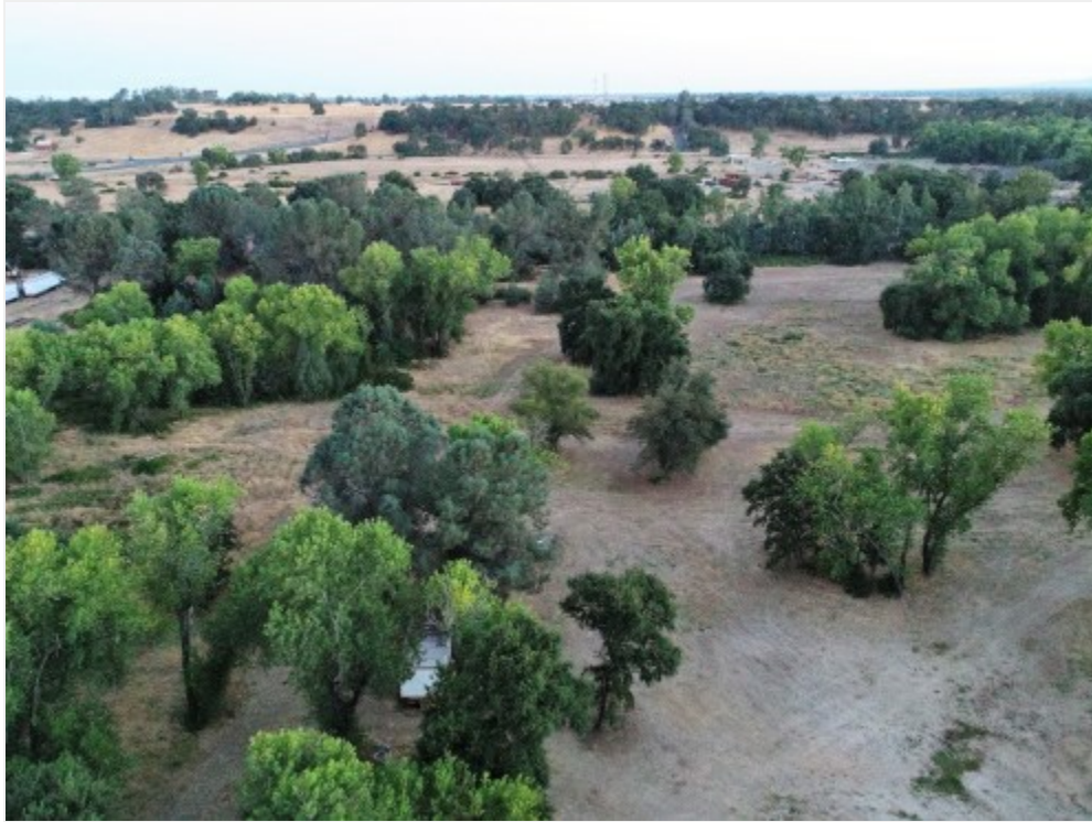
East View towards Sierra Nevada