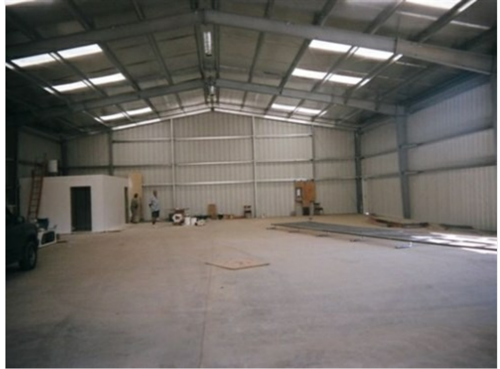
Interior of 6000 Sq Ft Warehouse