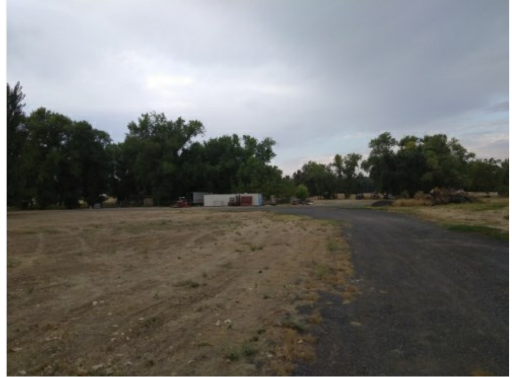
Fenced in Storage Yard