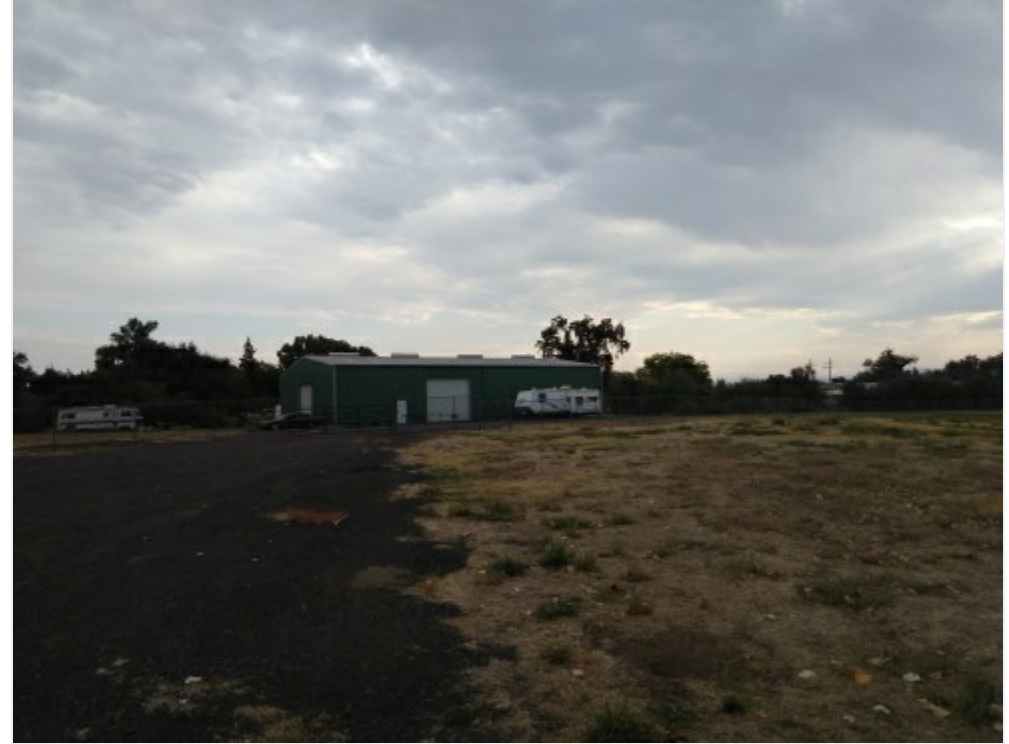
Full fence around warehouse