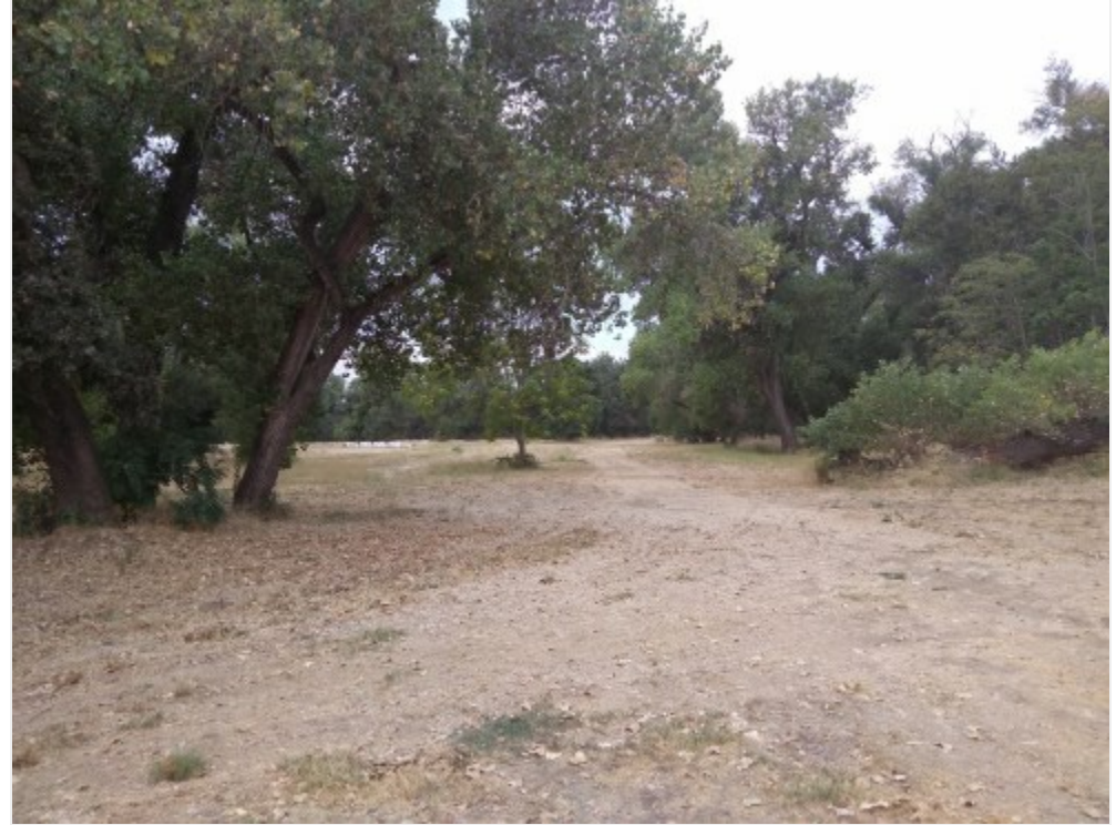
Level Acreage View