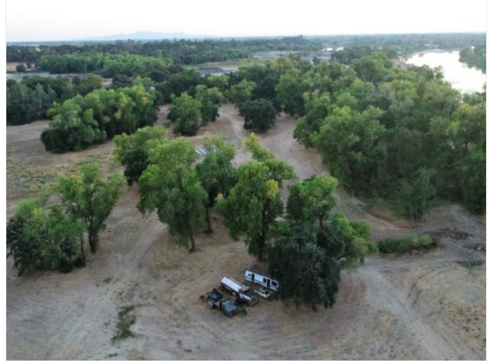
Interior Level Acreage Southern View