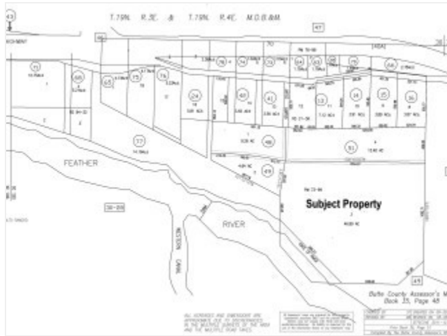
Assessors Parcel Map

64, 66 & 68 Stuart Court, Oroville, CA 95965