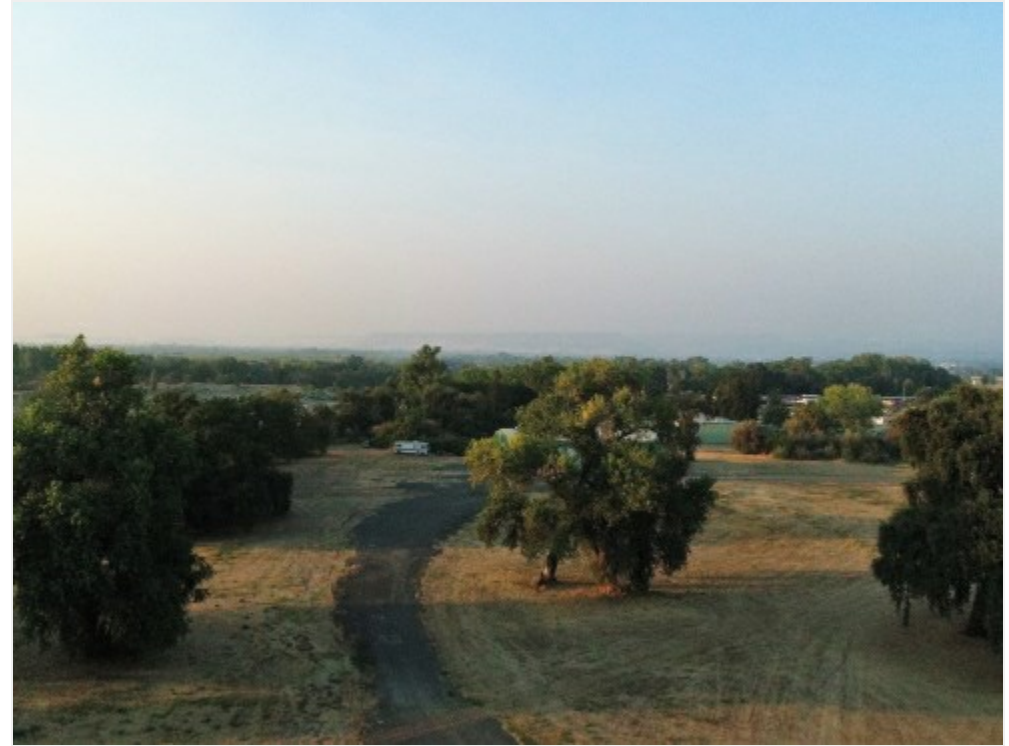
Interior View Access Road