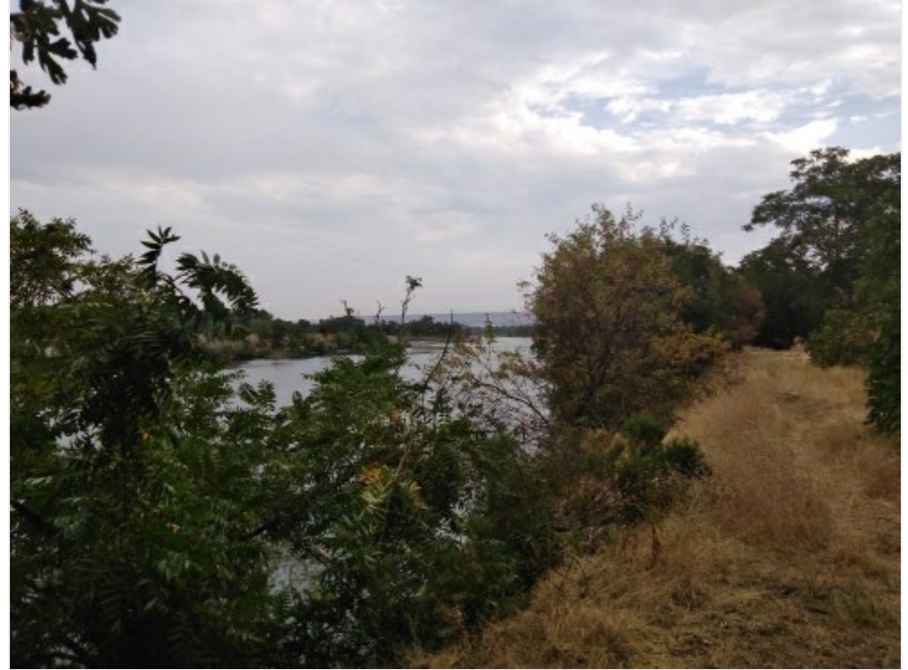
River View due North