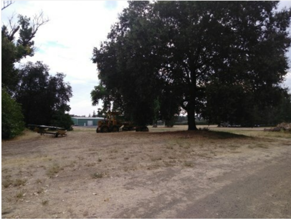
Level Acreage View