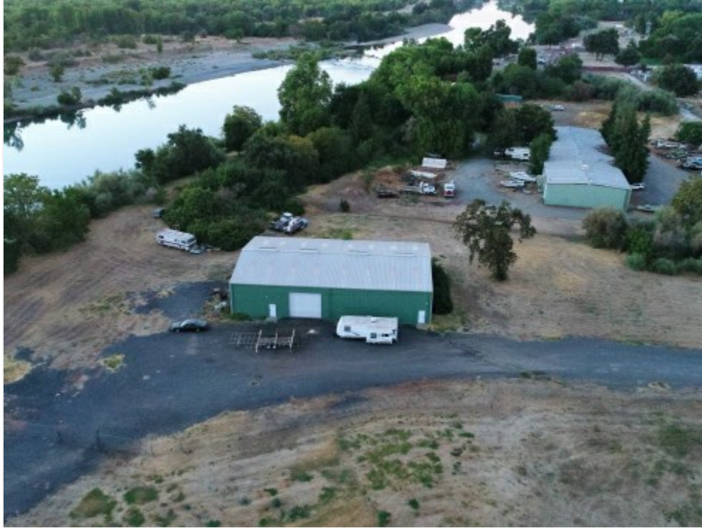
6000 Sq Ft Warehouse