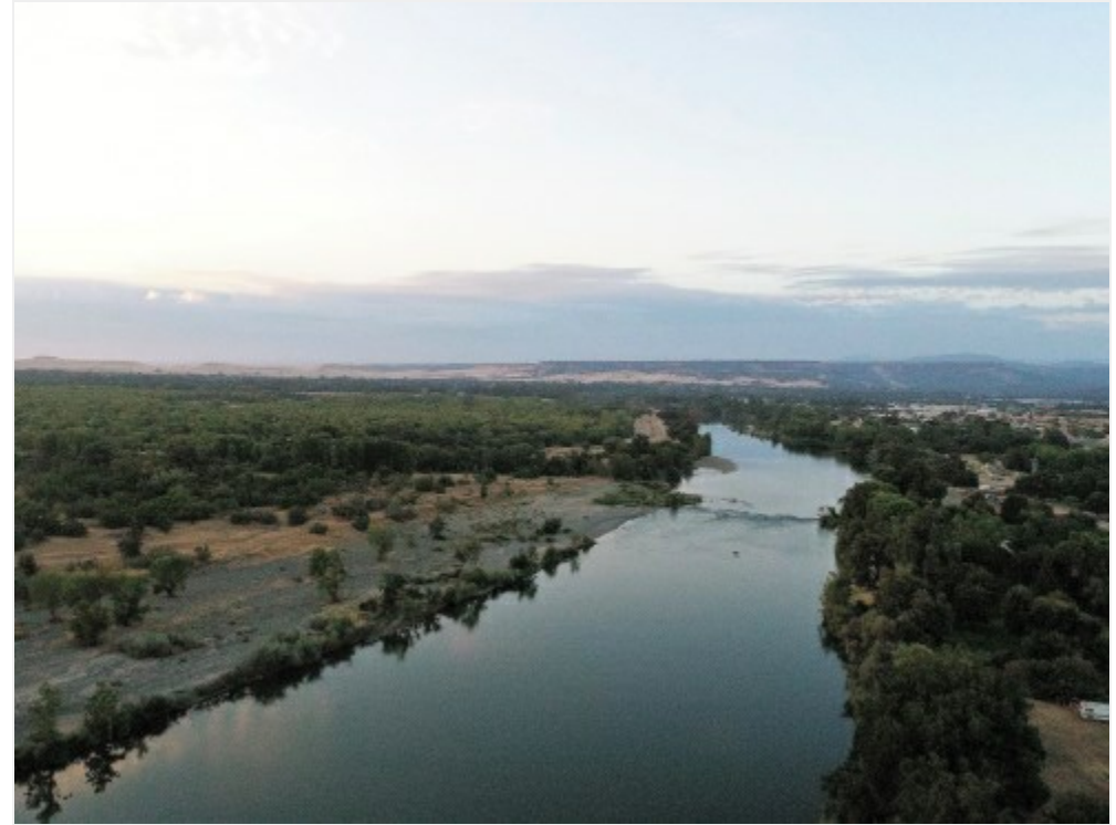
Property Right - Riparian Preserve Left