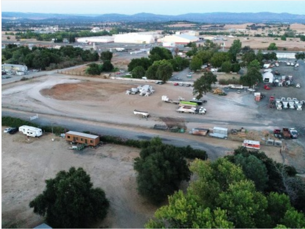
North East Highway 70 Industrial Park