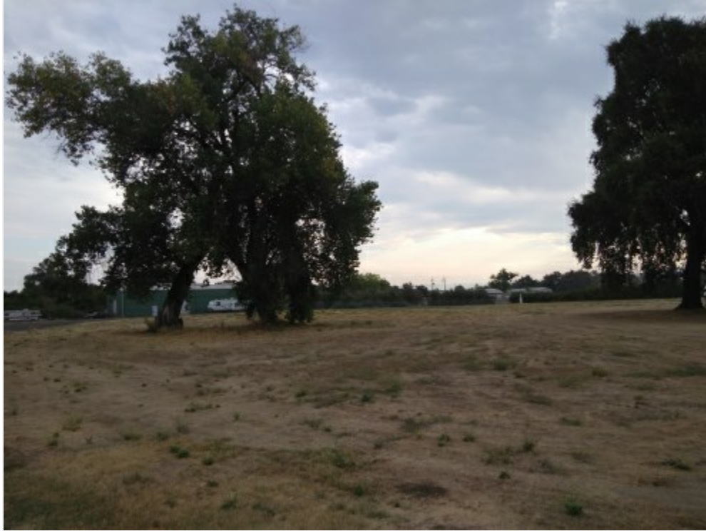
Level Acreage due North