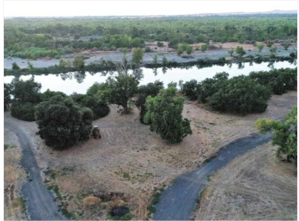
Coastal Range due West. 11,800 Acre Riparian Preserve Area