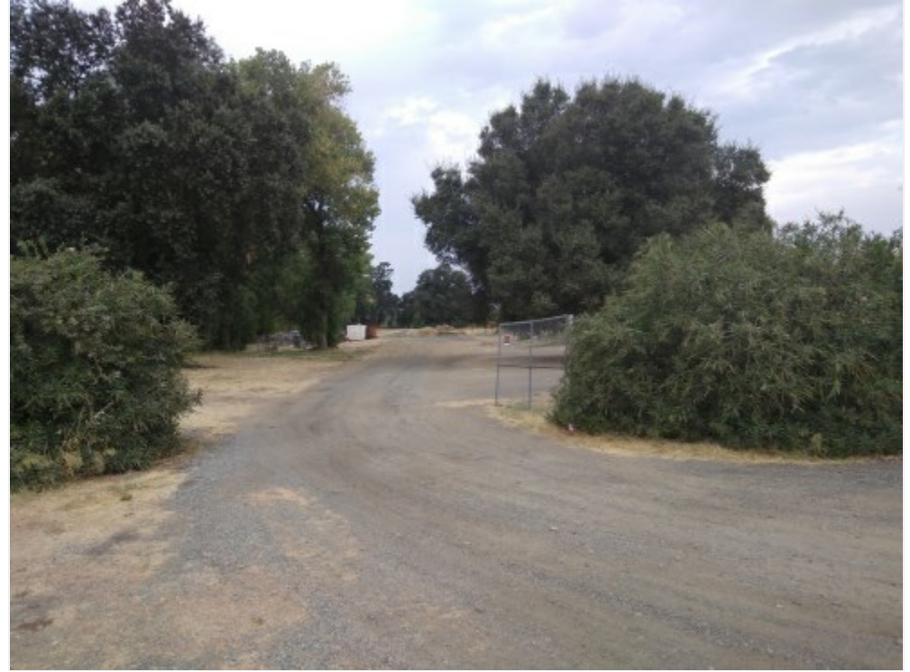
Main Entrance to House