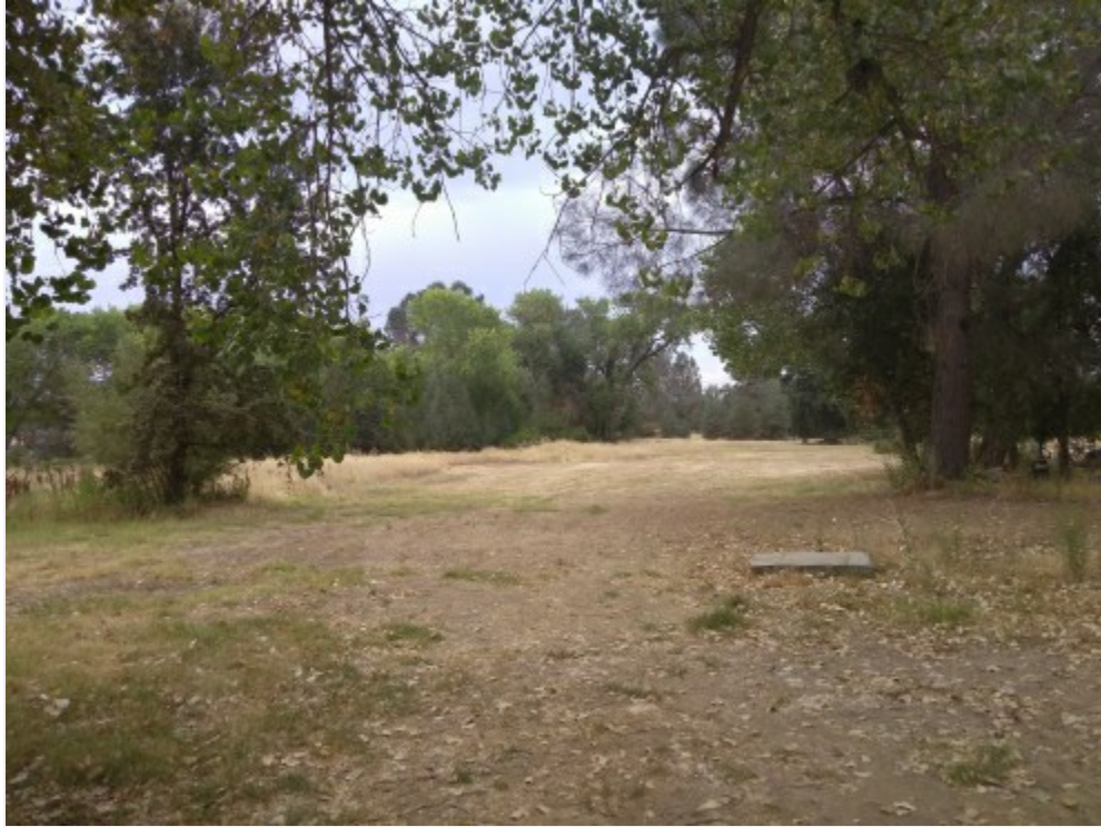
Level Acreage View