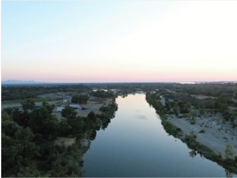
Feather River due South