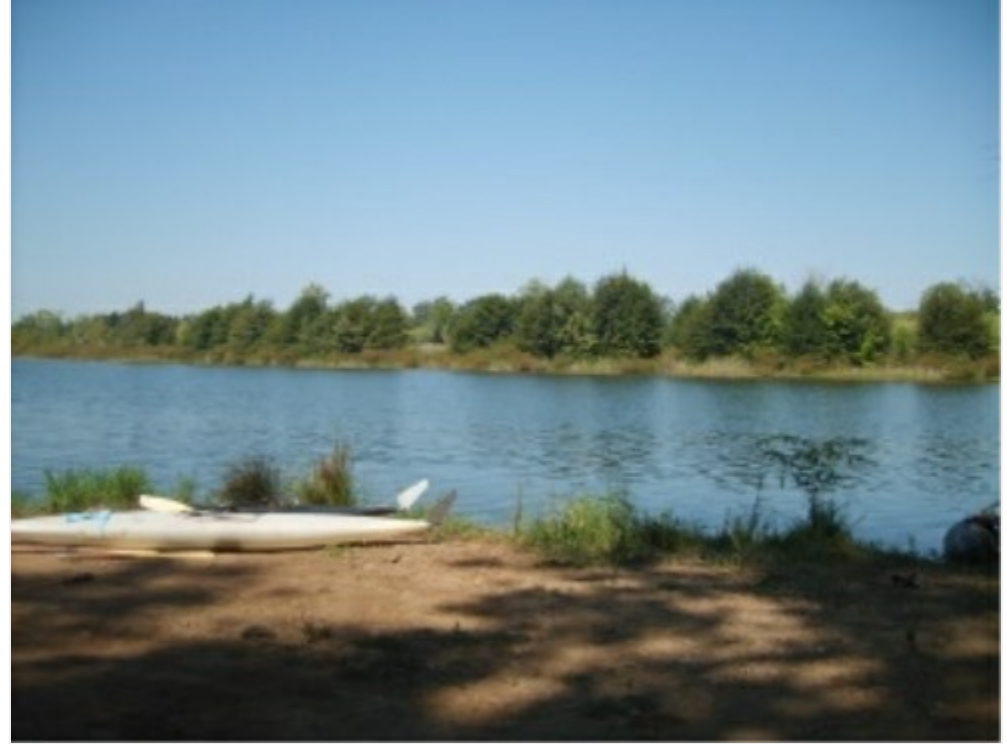
No Dock Needed