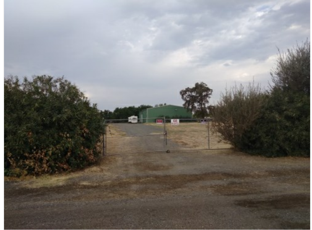
2nd Access Road to Warehouse