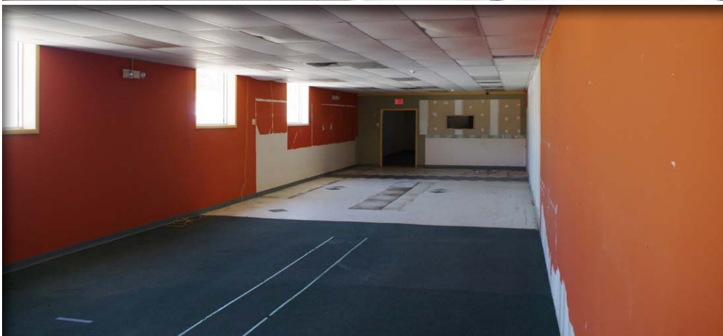
EXISTING CONDITIONS: VIEW TOWARDS BACK OF STORE