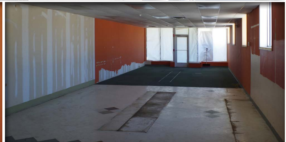
EXISTING CONDITIONS: VIEW TOWARDS FRONT OF STORE