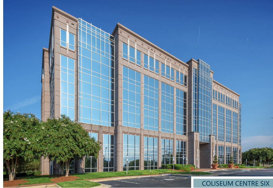
COLISEUM CENTRE SIX

Walking Distance to To Hotels, Restaurants & Retail