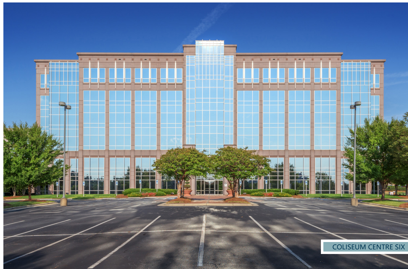
COLISEUM CENTRE SIX