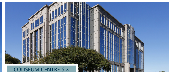
COLISEUM CENTRE SIX