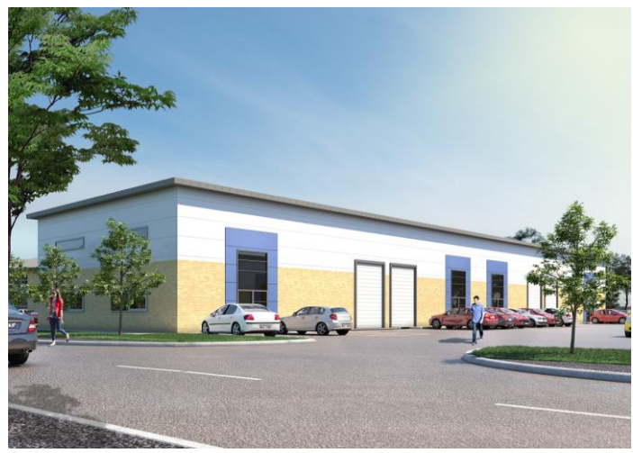
Light Industrial Units