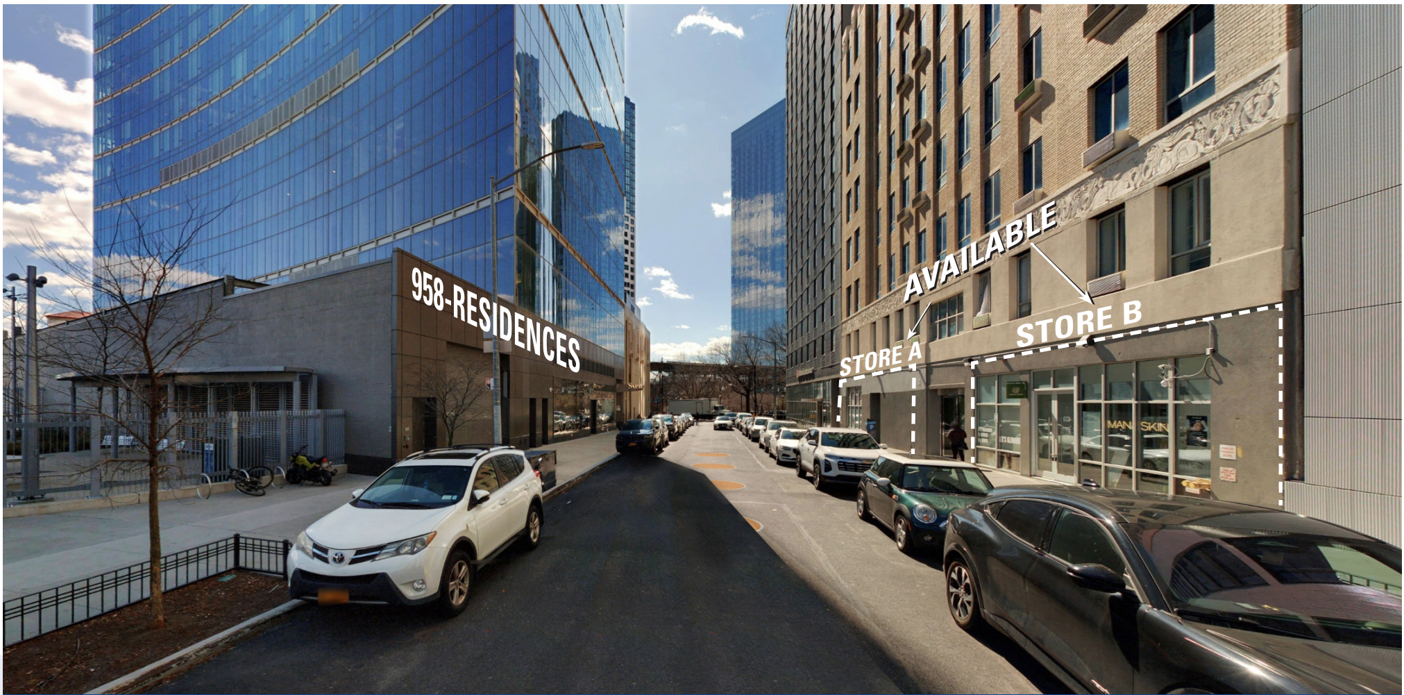
View Along 41st Avenue