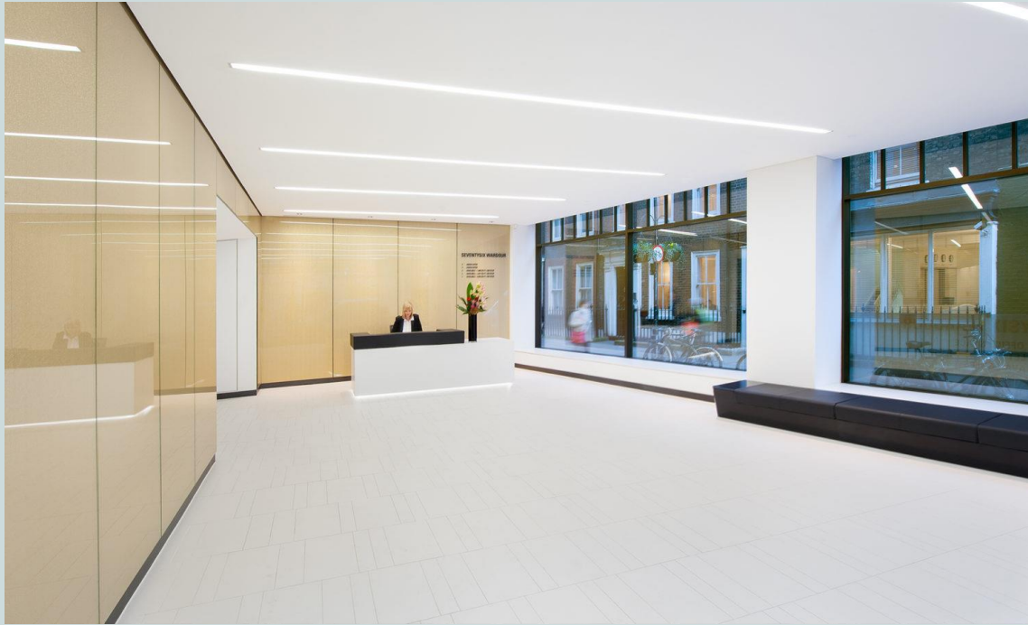
Ground floor reception