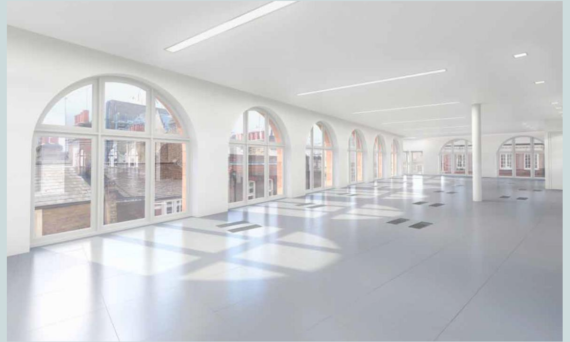
3 rd Floor – Photograph taken prior to tenant fit-out