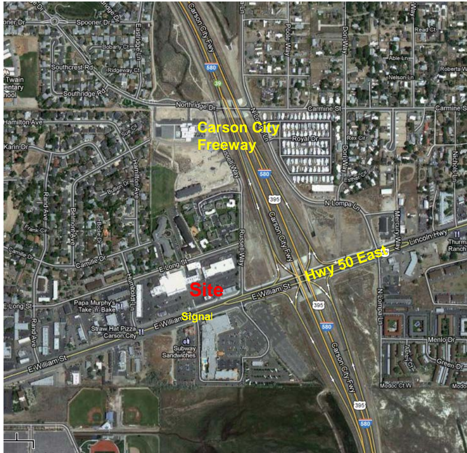
Aerial of Site

2100 East William Street, Carson City, Nevada