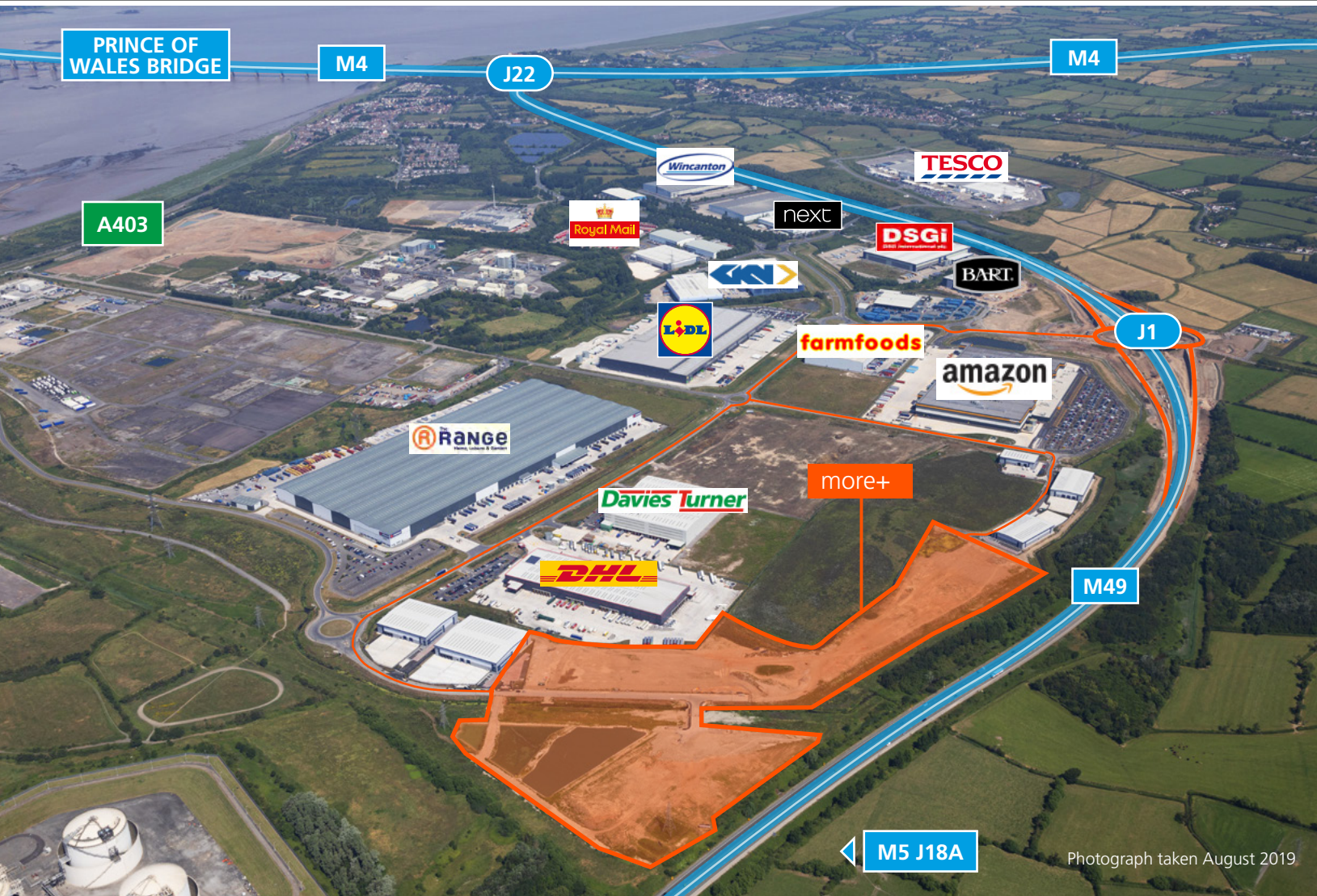
Photograph taken August 2019

CENTRAL PARK ■ J1 M49 ■ BRISTOL ■ BS35 4GH