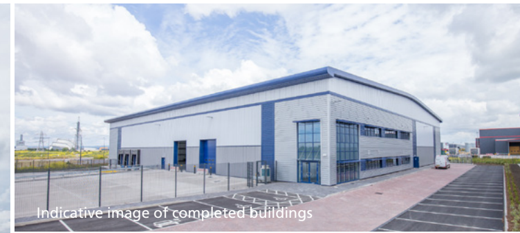
Indicative image of completed buildings