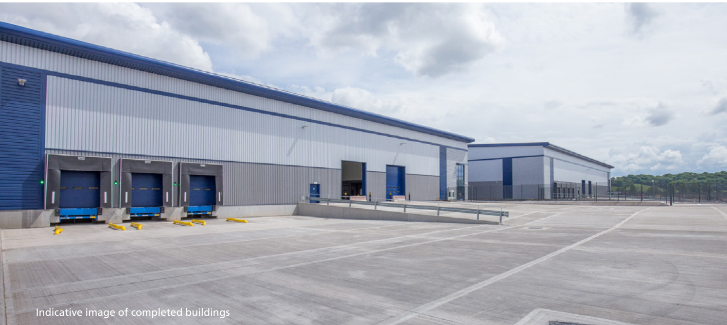
Indicative image of completed buildings