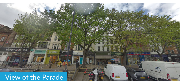
View of the Parade

£130,000 per annum, exclusive of rates, Service Charge and all other outgoings.