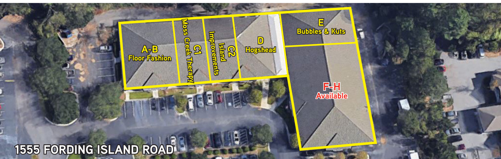
1555 FORDING ISLAND ROAD

The information contained herein has been obtained from sources deemed reliable. While every reasonable effort has been made to ensure its accuracy, we cannot guarantee it. No responsibility is assumed for any inaccuracies. Readers are encouraged to consult their professional advisers prior to acting on any of the material contained in this report.