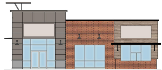
Rendering: Shops Elevation

Recently approved by the City of Meridian 130,000 SF Premium Athletics and Spa Complex Opening Spring 2020