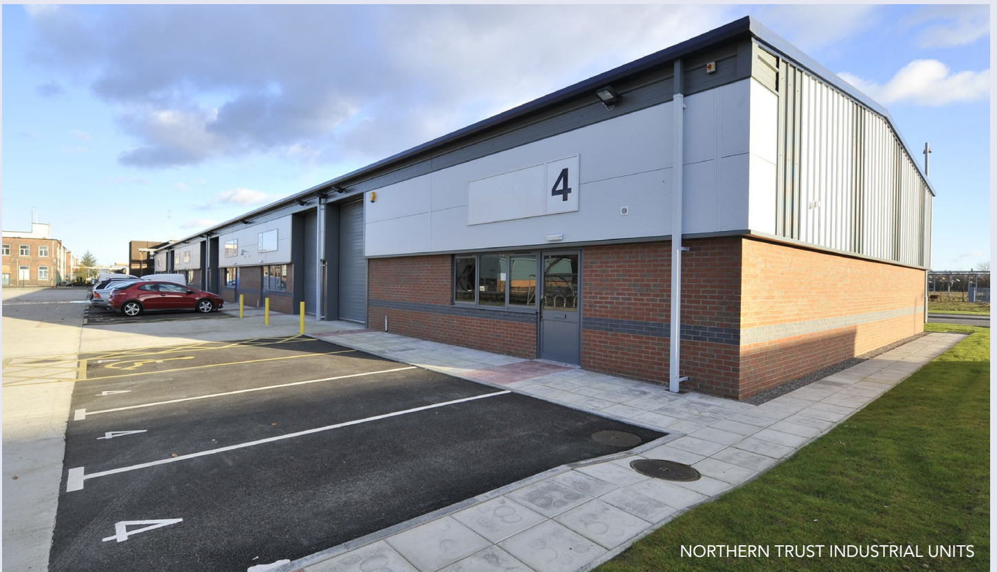
NORTHERN TRUST INDUSTRIAL UNITS

A UNIQUE COMBINATION OF AVAILABLE LAND AND A TAILOR-MADE PACKAGE TO SUPPORT YOUR BUSINESS