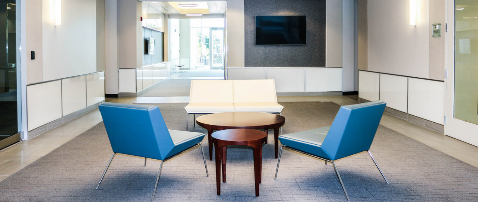
WATERVIEW II NEWLY RENOVATED LOBBY! WATERVIEW III LOBBY RENOVATIONS FALL 2018!