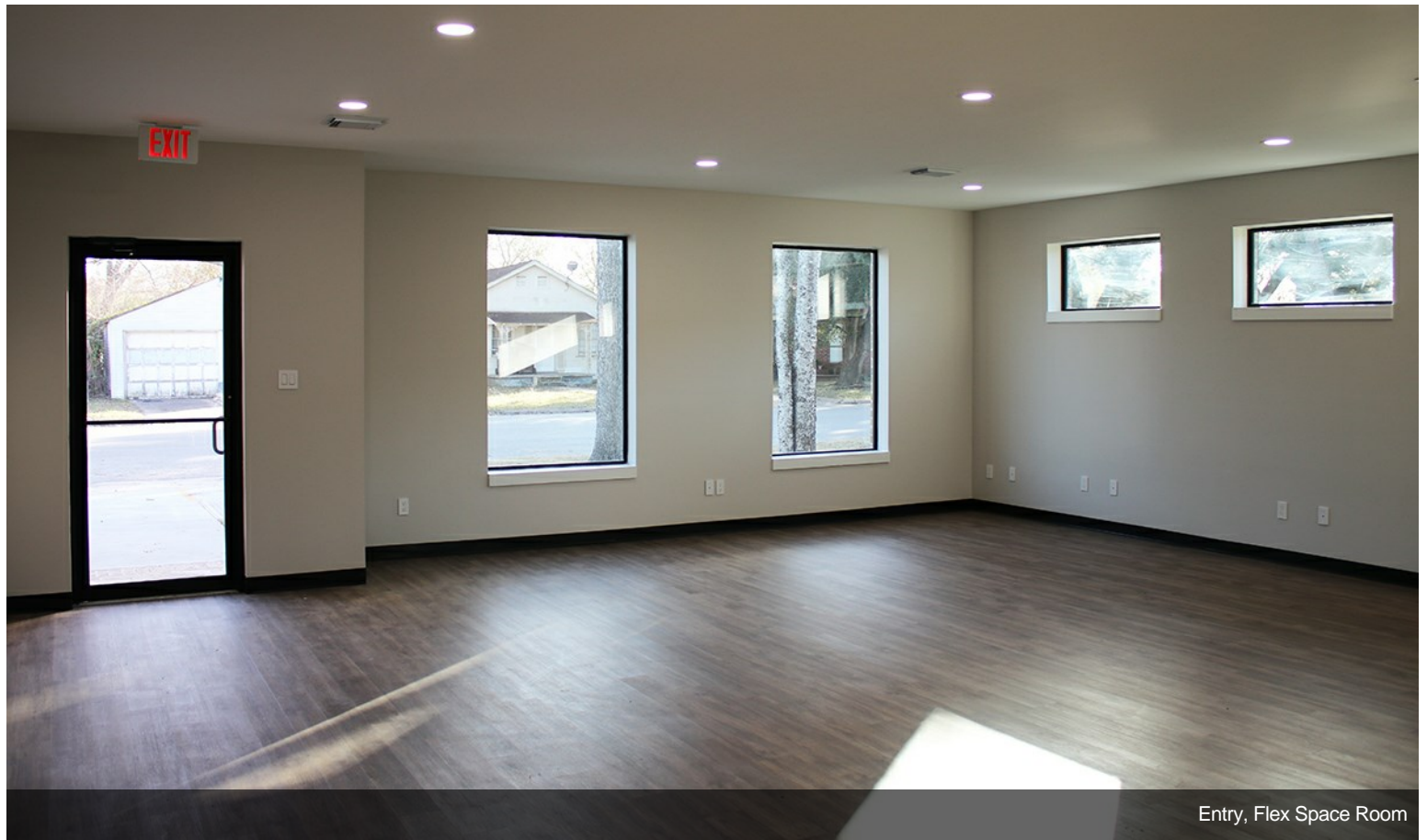
Entry, Flex Space Room