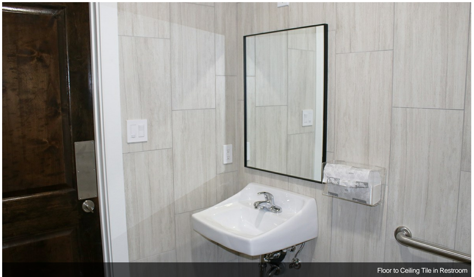
Floor to Ceiling Tile in Restroom