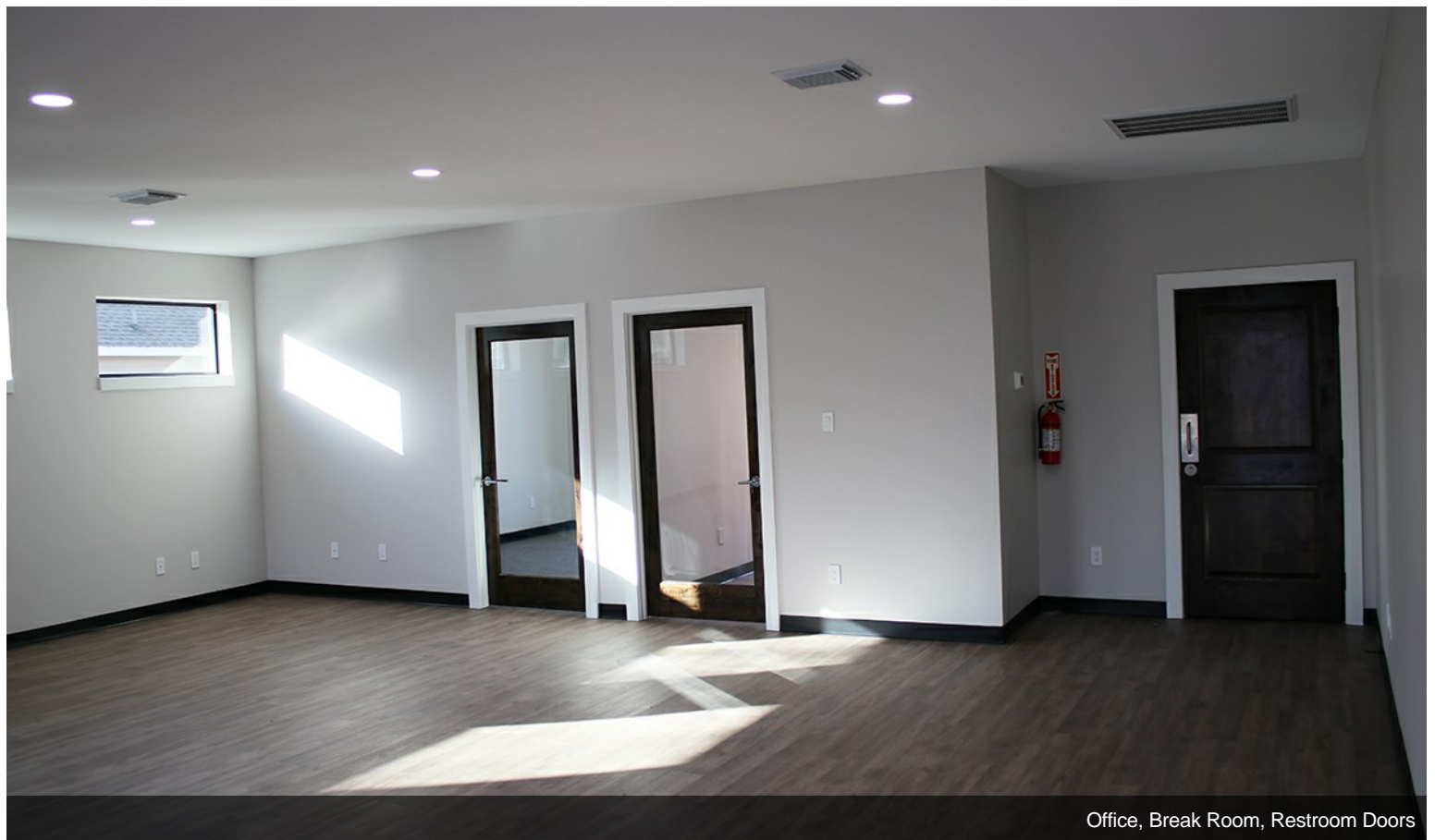
Office, Break Room, Restroom Doors