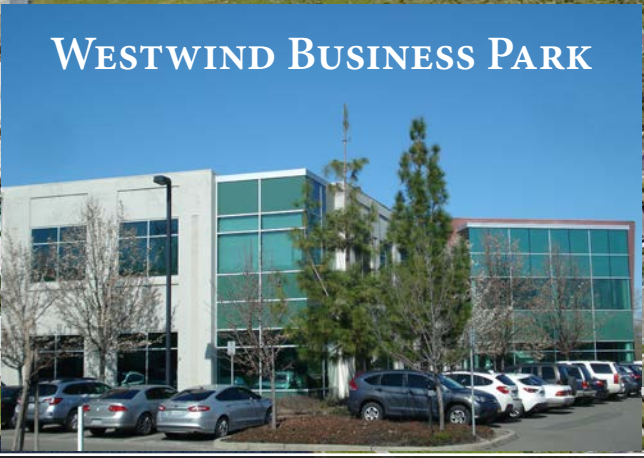
WESTWIND BUSINESS PARK