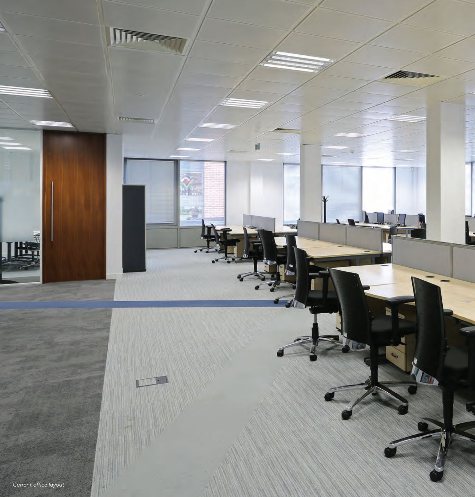
Current office layout