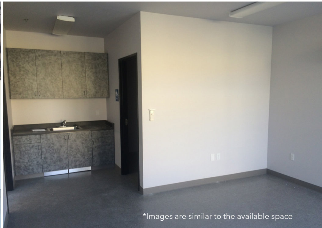
*Images are similar to the available space