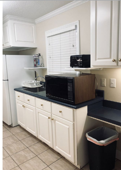
Click image for larger view