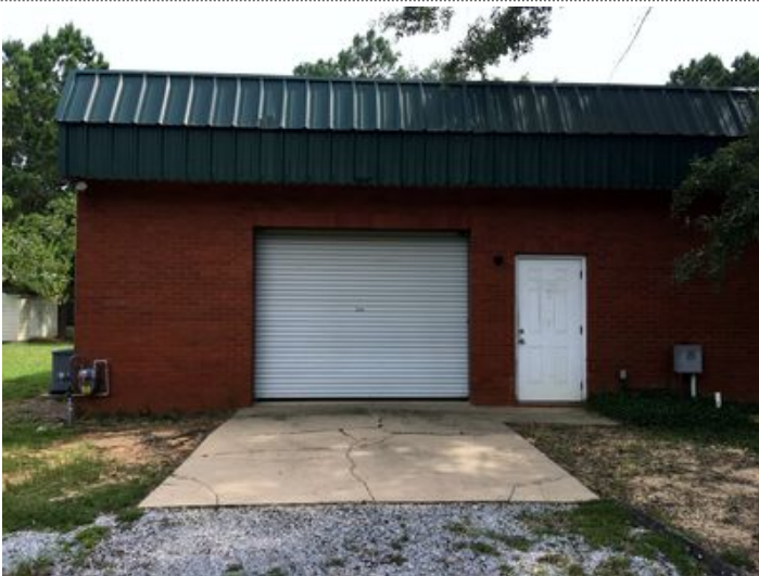
Rollup Door to Warehouse