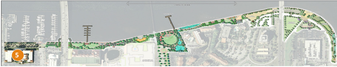
Bradenton Riverwalk & Park